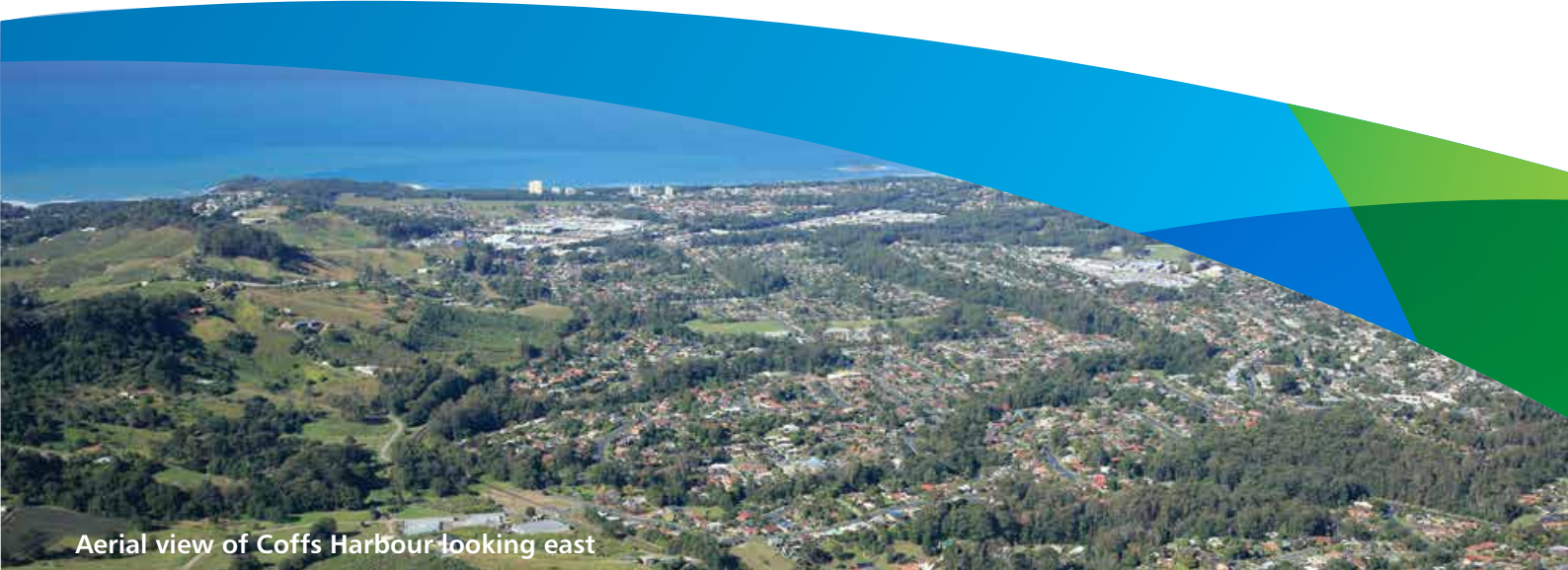
Aerial view of Coffs Harbour looking east