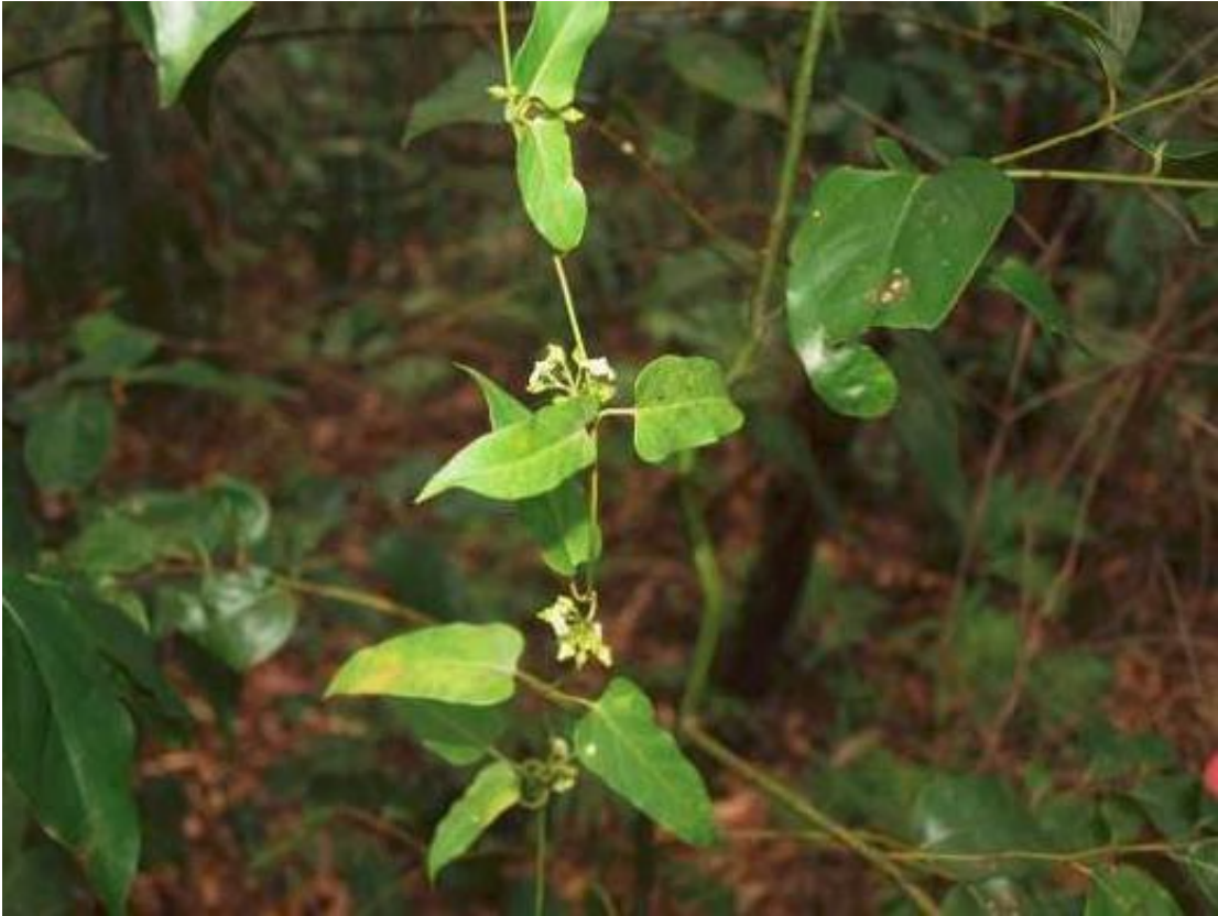
Plate 1: Slender Marsdenia ( Marsdenia longiloba ) produces umbels of white flowers in the leaf axils. Leaves are similar to Woolls' Tylophora, both species have clear sap.