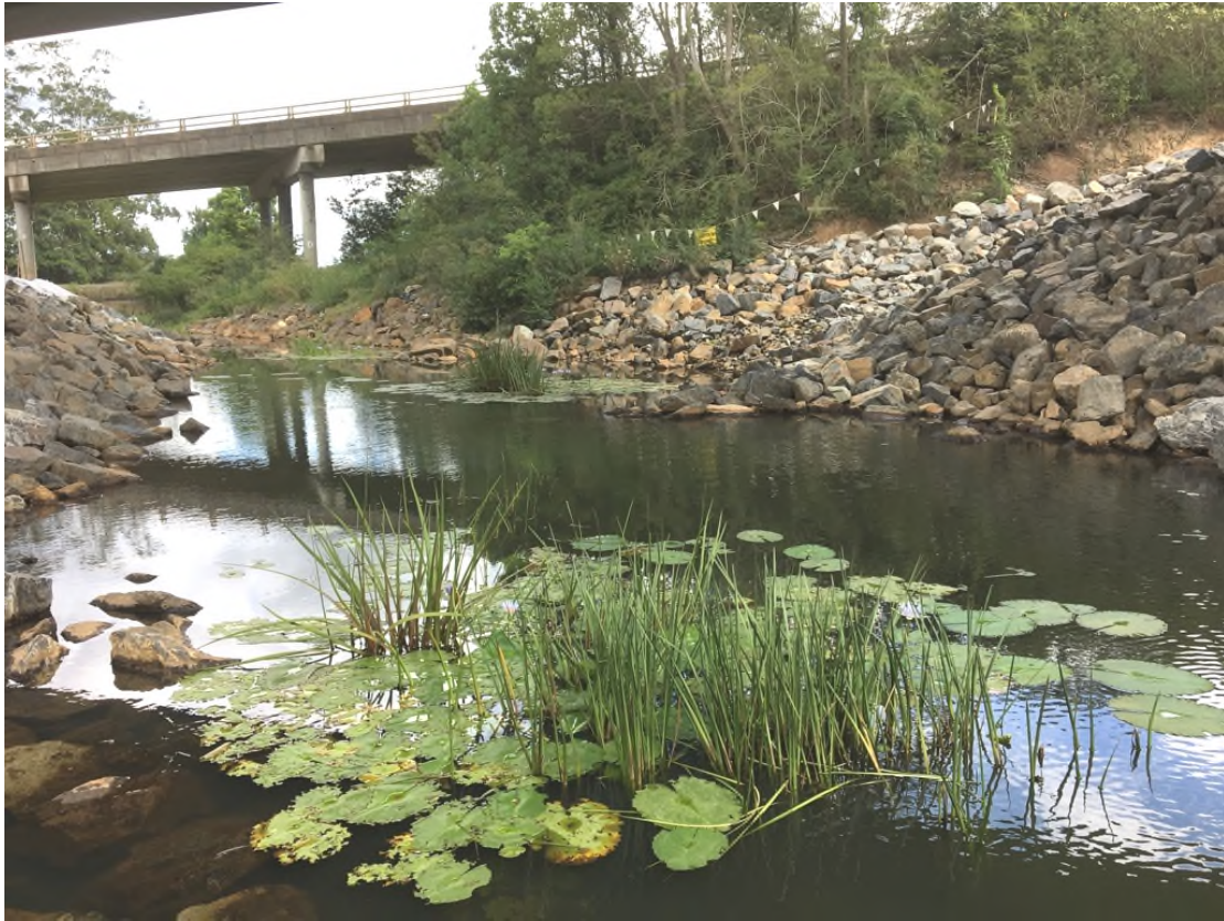
Plate 6: Clumps of Maundia (the sword-leaved aquatic plant) reinstated along Williamson's Creek two years after salvaging Maundia from the creek prior to construction of a new bridge and stabilisation of the creek banks.