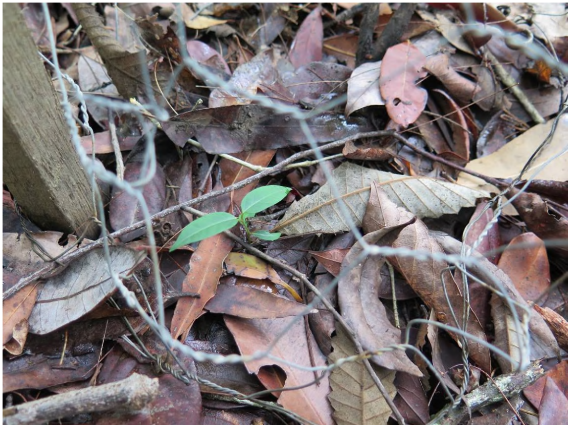
Plate 16: Receival site no. 3, plant no. 13. Small shoot of Slender Marsdenia. 17/1/2017