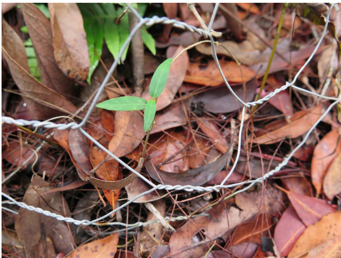
Plate 8: Receival Site No. 1. Plant no. 14. A small shoot of Slender Marsdenia. 16/1/2017