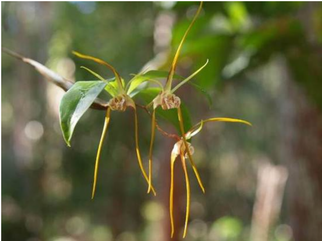
Plate 4: Spider Orchid ( Dendrobium melaleucaphilum ) produces large, vanilla scented flowers in August and September.