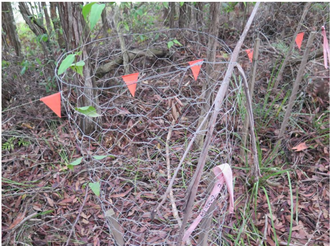
Plate 14: Receival site no. 2, plant no. 2, Slender Marsdenia climbing out of wire cage. This site is relatively exposed to NE to SE winds due to the cleared road corridor, but there are no obvious adverse effects on Slender Marsdenia. 16/1/2017