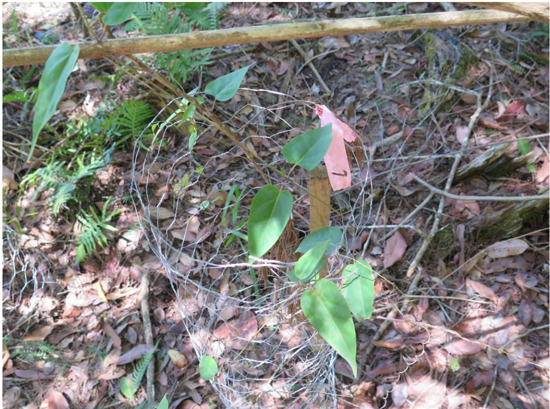
Plate 28: Receival site no. 6, plant no. 7. 17/1/2017