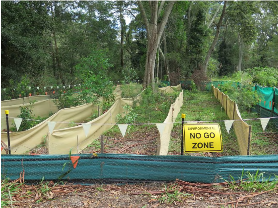
Plate 35 :Receival site no. 9 for Floyds Grass, Area 1, habitat overview. 17/1/2017