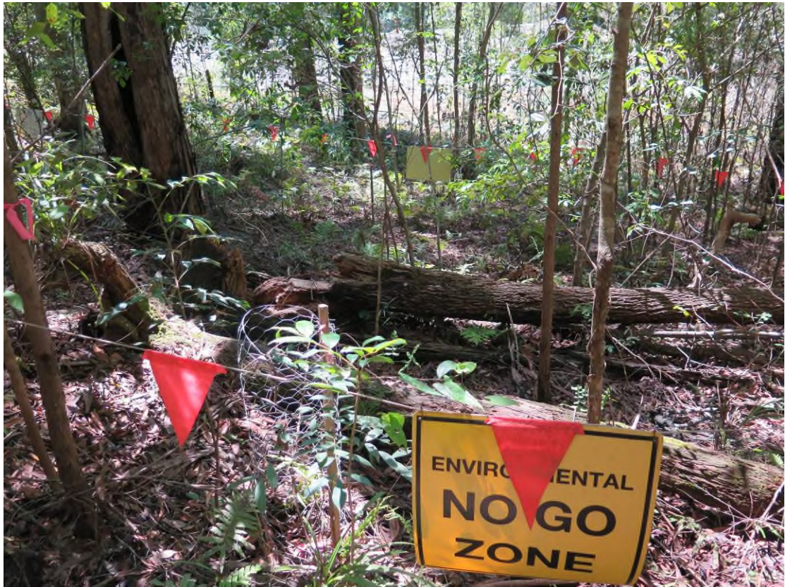
Plate 31: Receiving site no. 8, habitat overview. 17/1/2017