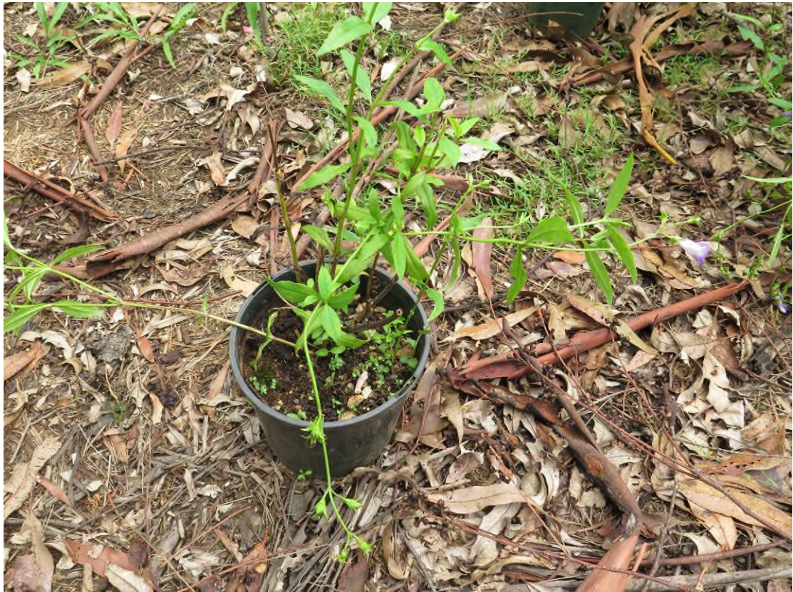
Plate 39: Receival site no. 9. One year old Koala Bells plant introduced to site 9 in January 2017.