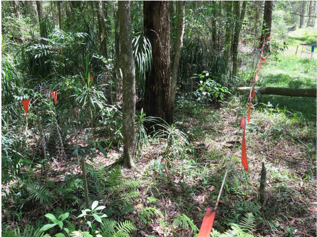
Plate 29: Receiving site no. 7, Koala Bells, habitat overview, translocated plants on left hand side. 17/1/2017