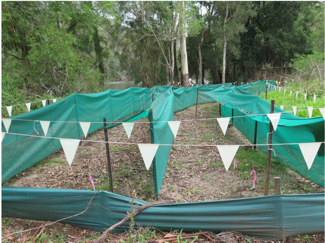
Plate 37: Receival site no. 9 for Floyds Grass, Area 2, habitat overview. 17/1/2017