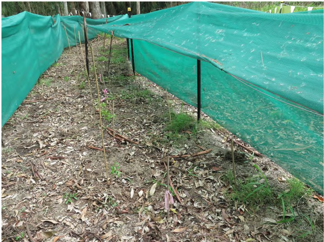
Plate 40: Receival site no. 9, Area 2. Koala Bells planted in a row marked by bamboo stakes with Floyds Grass. 17/1/2017.