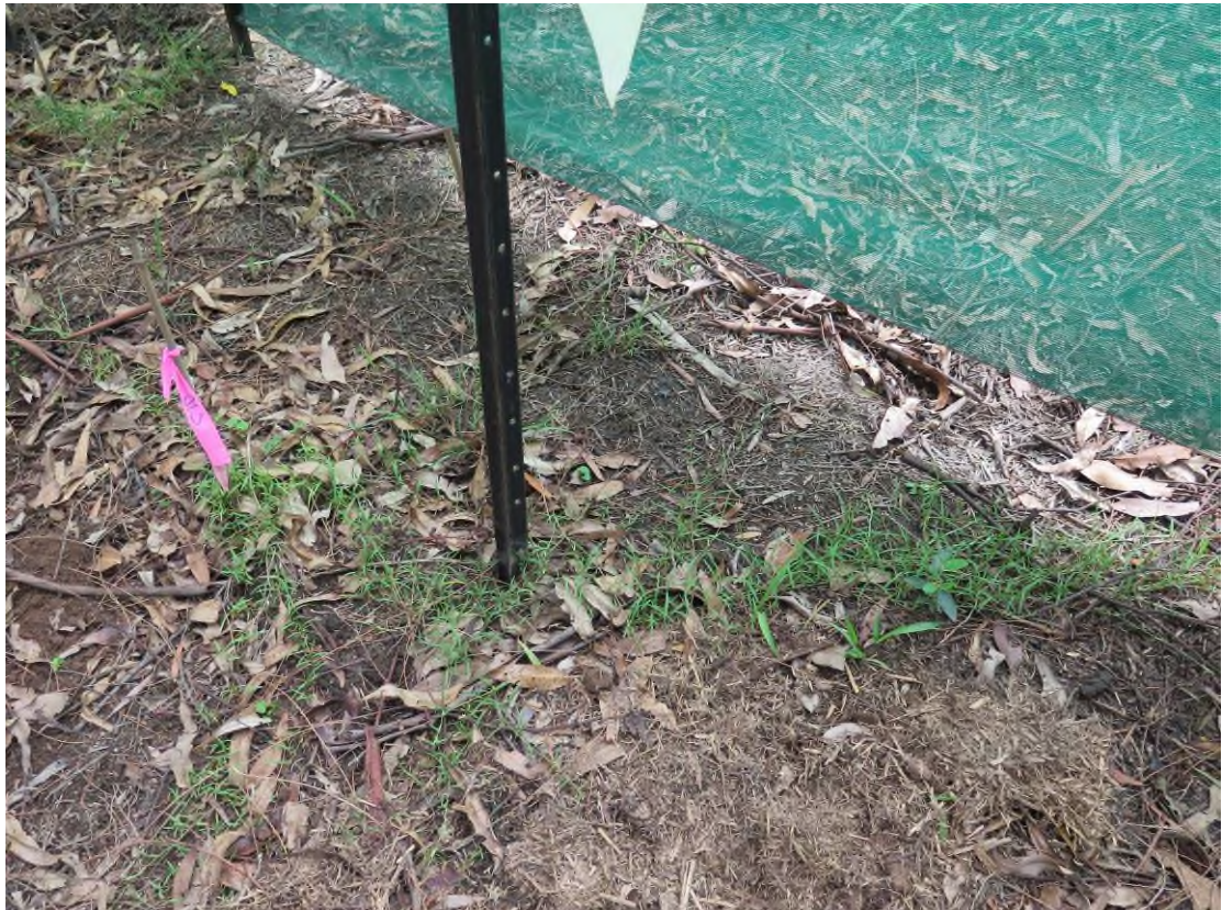
Plate 38 : Receival site no. 9 for Floyds Grass, Area 2. Floyds Grass runner extending from pink tag to under shade cloth to the right after 9 months. 17/1/2017