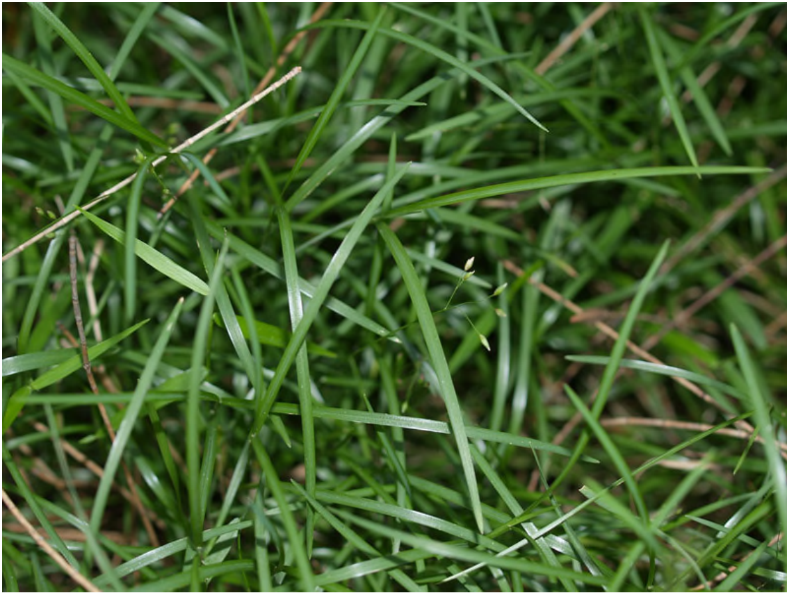
Plate 5: Floyds Grass ( Alexfloydia repens ) a rare mat-forming grass found along creeks between Coffs Harbour and Warrell Creek