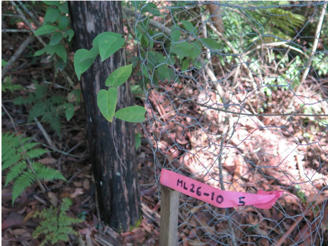
Plate 20: Receival site no. 5, plant no. 5. The other identifier is the source/donor site code. 17/1/2017