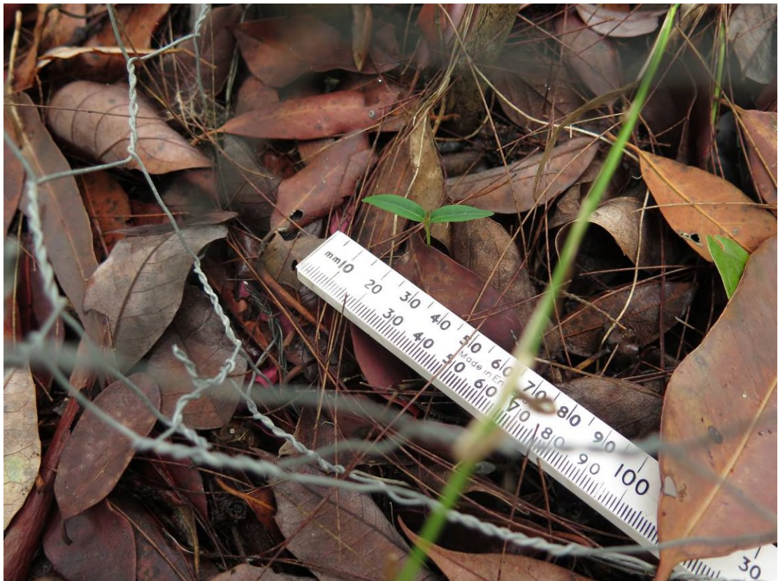
Plate 10: Receiving Site No. 1. Plant no. 21. Small shoot of Slender Marsdenia. 16/1/2017