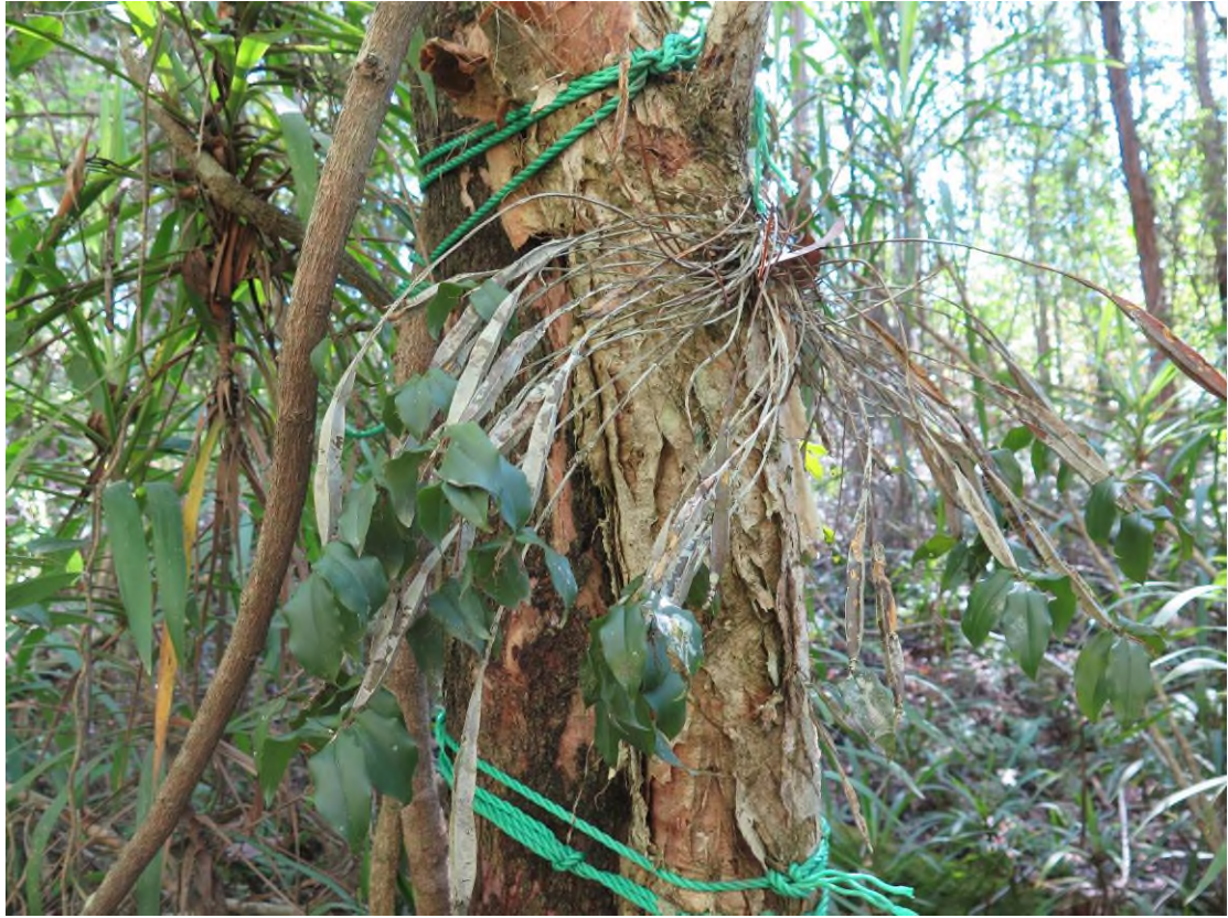
Plate 24: Receival site no. 5. The larger of two Spider Orchid clumps translocated to site 5. The plant consists of numerous angled pseudobulbs produced on wiry stems, with a pair of leaves at the end. Flowers are produced from the apex between the leaves. The section of branch/stem of the host tree supporting the orchid plant and its roots that extend for some distance along the stem was tied onto the trunk of a rainforest mid-stratum tree in a shaded gully with nylon rope. 17/1/2017