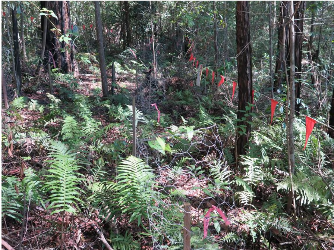
Plate 18: Receival site no. 5 adjacent to Old Coast Rd. Habitat overview. 17/1/2017