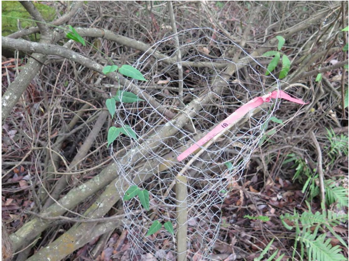
Plate 17: Receival site no. 3, plant no. 18. Slender Marsdenia. 17/1/2017