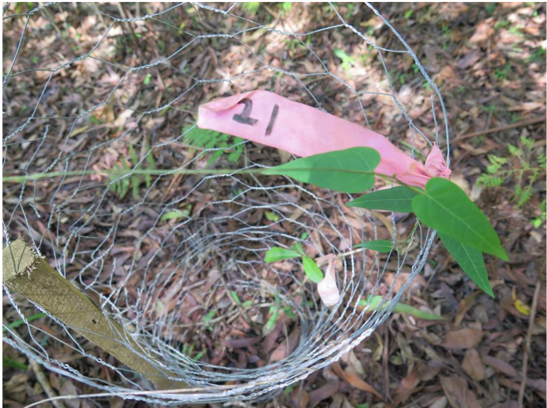
Plate 34: Receival site no. 8, plant no. 21