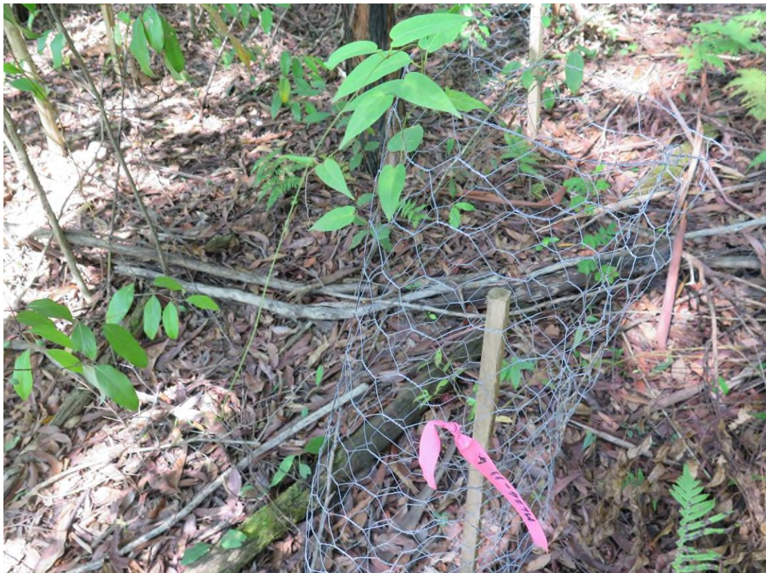
Plate 19: Receival site no. 5, plant no. 4. Slender Marsdenia climbing out of cage. A long thin leader stem can be seen drooping down to the left. Leaders die back if they cant find something to grasp onto so they can climb higher. 17/1/2017