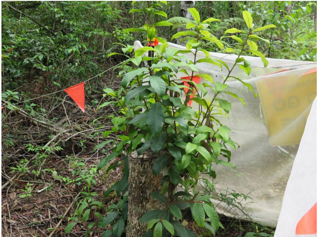
Plate 11 ::Receival site no. 1, Rusty Plum resprouting vigorously from trunk pruned down to 1.3 metres after the tree was excavated with little root ball. 16/1/2017