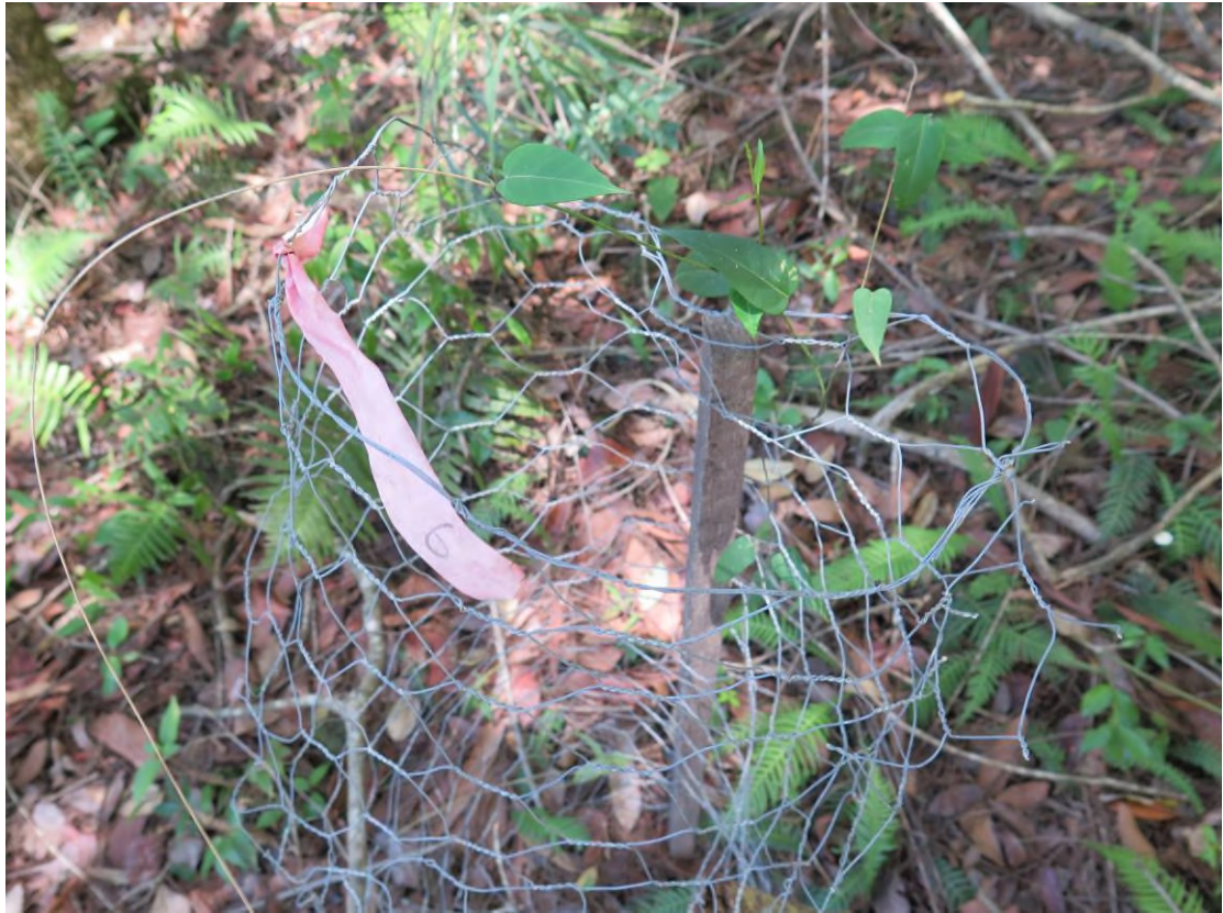
Plate 27: Receival site no. 6, plant no. 6. 17/1/2017