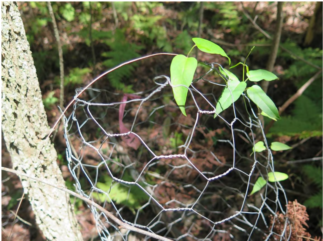
Plate 32: Receiving site no. 8, plant no. 14. Slender Marsdenia with long leader arching down over top of cage which has stopped growing and died off (turned brown). 17/1/2017