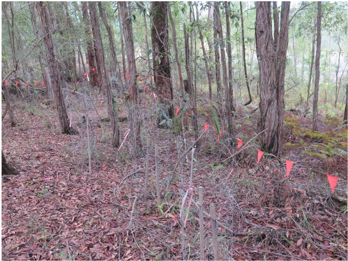
Plate 13: Receival site no. 2 adjacent to Old Coast Rd, highway corridor in background. Wire cages contain transplanted Slender Marsdenia. 16/1/2017