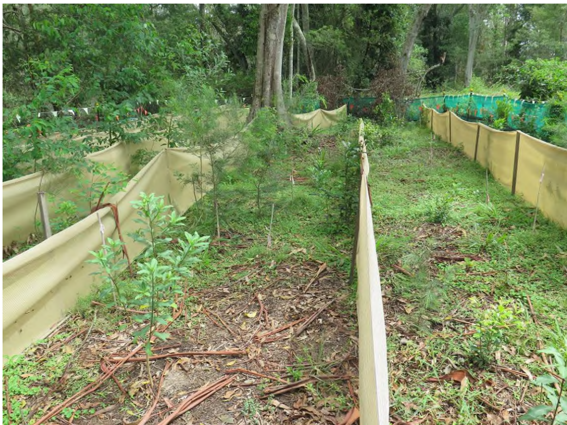
Plate 36 :Receival site no. 9 for Floyds Grass, Area 1. Rows 1-3 closest to the creek on the left hand side had a good cover of Floyds Grass after 1.5 years. 17/1/2017