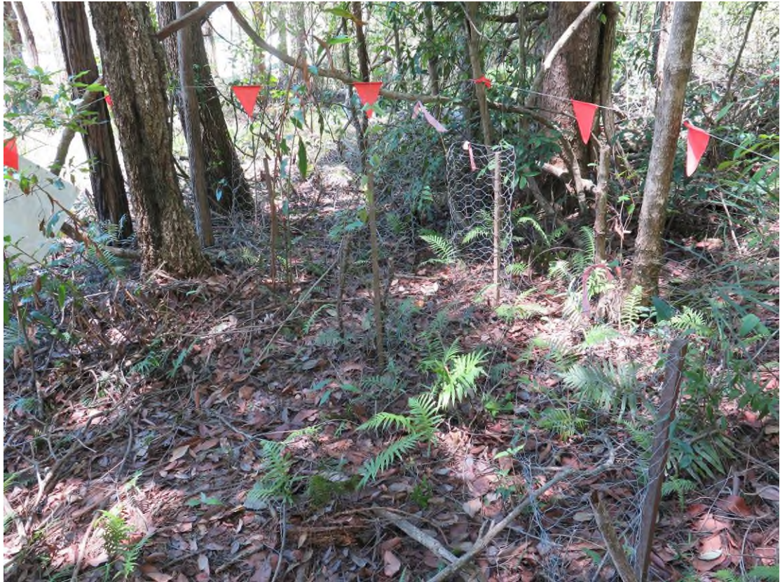
Plate 25: Receival site no. 6 for Slender Marsdenia and Woolls Tylophora, habitat overview. 17/1/2017