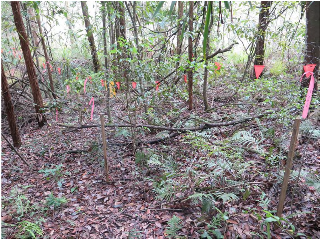
Plate 15: Receival Site no. 3 habitat showing same type of open litter and fern covered ground layer in moist open forest favoured by Slender Marsdenia. 17/1/2017