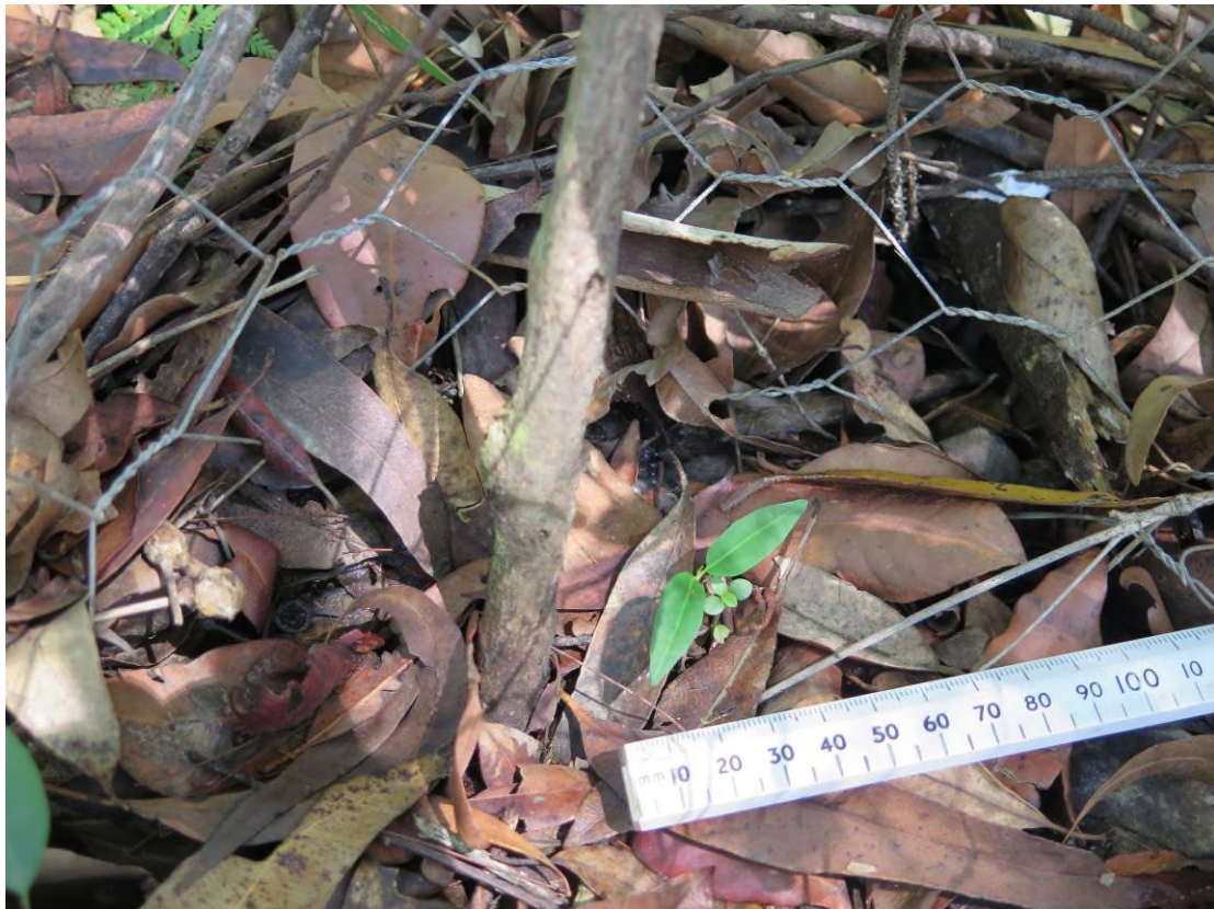
Plate 21: Receival site no. 5, plant no. 8. Another plant consisting of a small shoot, generally produced after a previous stem died back. 17/1/2017