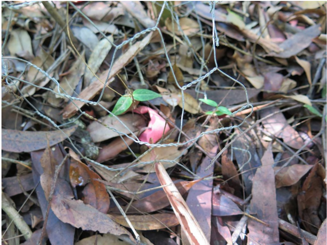
Plate 22: Receival site no. 5, plant no. 23 consisting of two small shoots produced after a previous stem died back. 17/1/2017