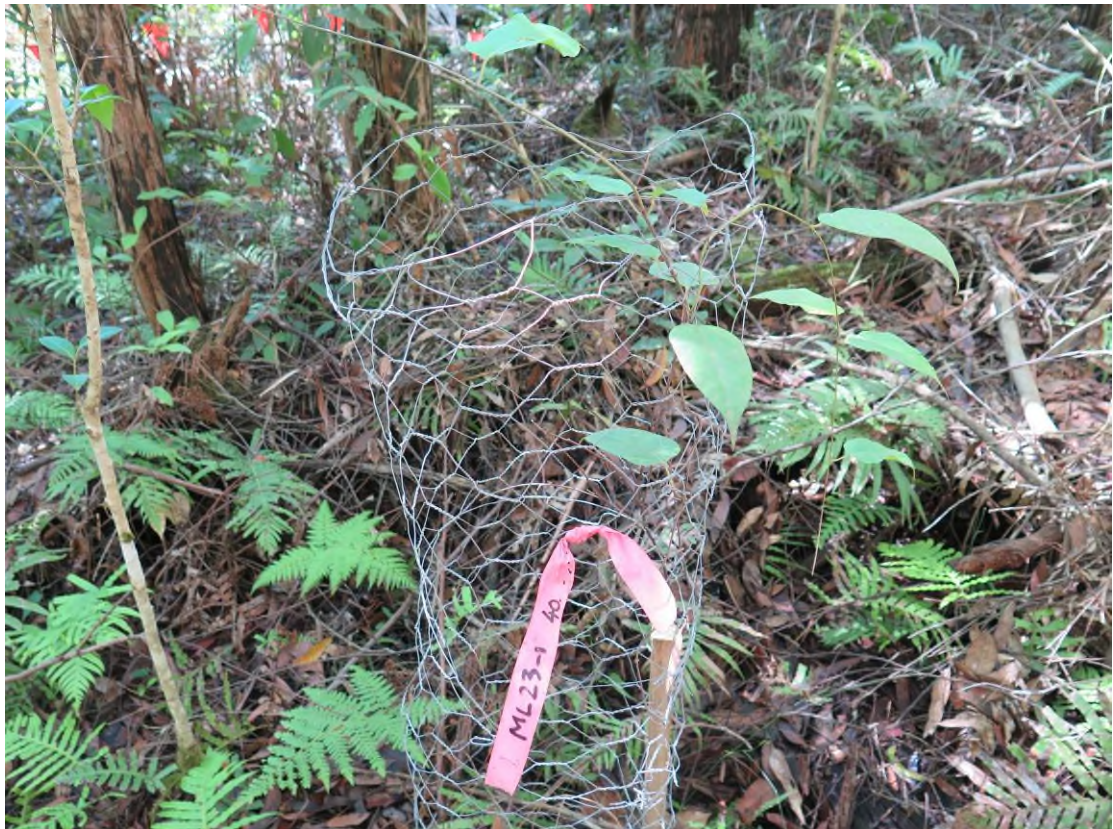
Plate 23: Receival site no. 5, plant no. 40. A fine leader stem can be seen ascending into the vegetation above. 17/1/2017