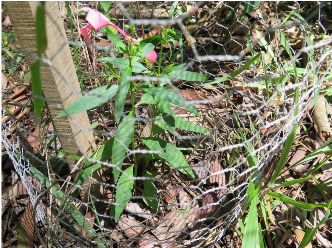
Plate 30: Receiving site no. 7, Koala Bells with flower buds. 17/1/2017