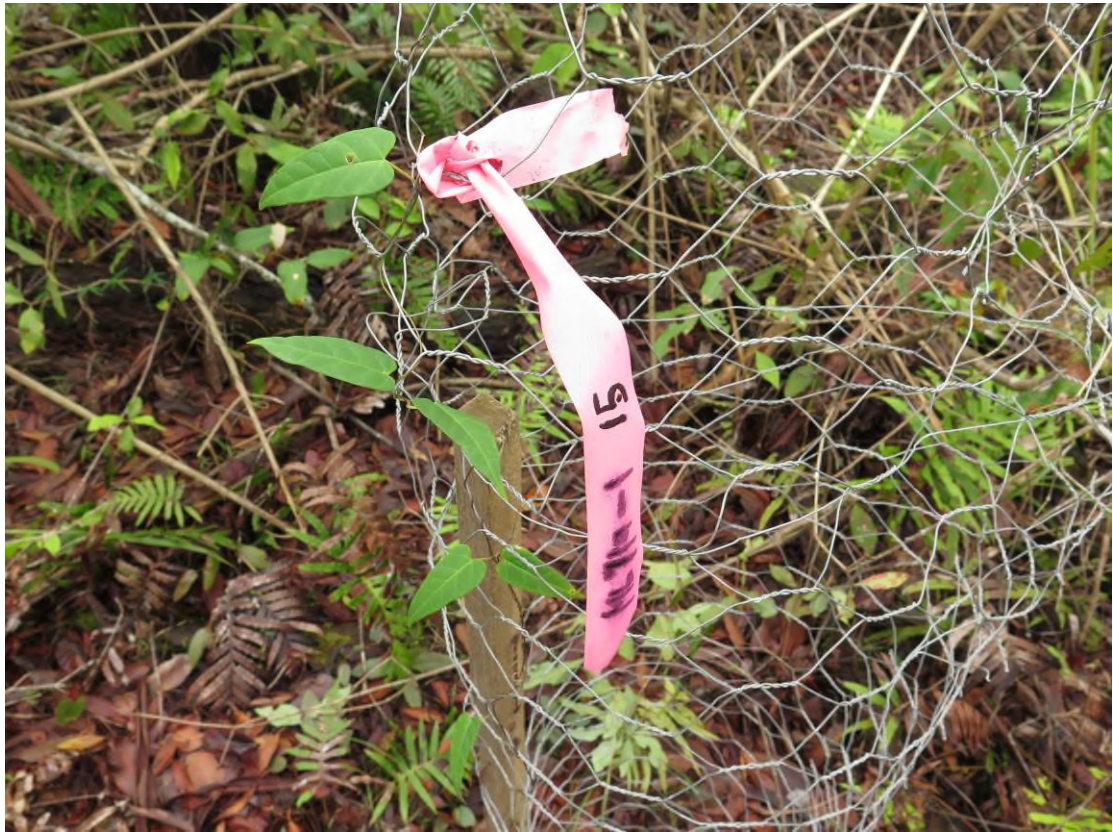
Plate 9: Receiving Site No. 1. Plant no. 15. Slender Marsdenia climbing wire cage. 16/1/2017