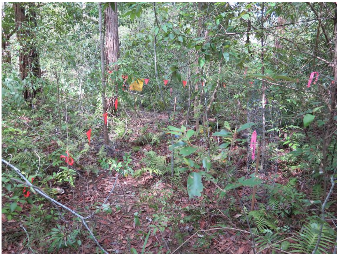
Plate 7: Receival Site 1 in the Road Reserve at the southern end of the project. Moist open forest with a leaf litter and light fern dominated ground layer. 16/1/2017