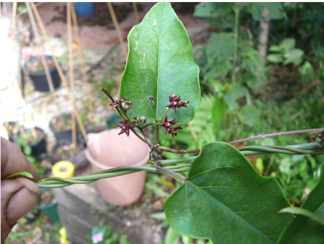
Plate 2: Woolls' Tylophora ( Tylophora woollsi ) has purplish flowers arranged in a short cymose panicle in the leaf axil.