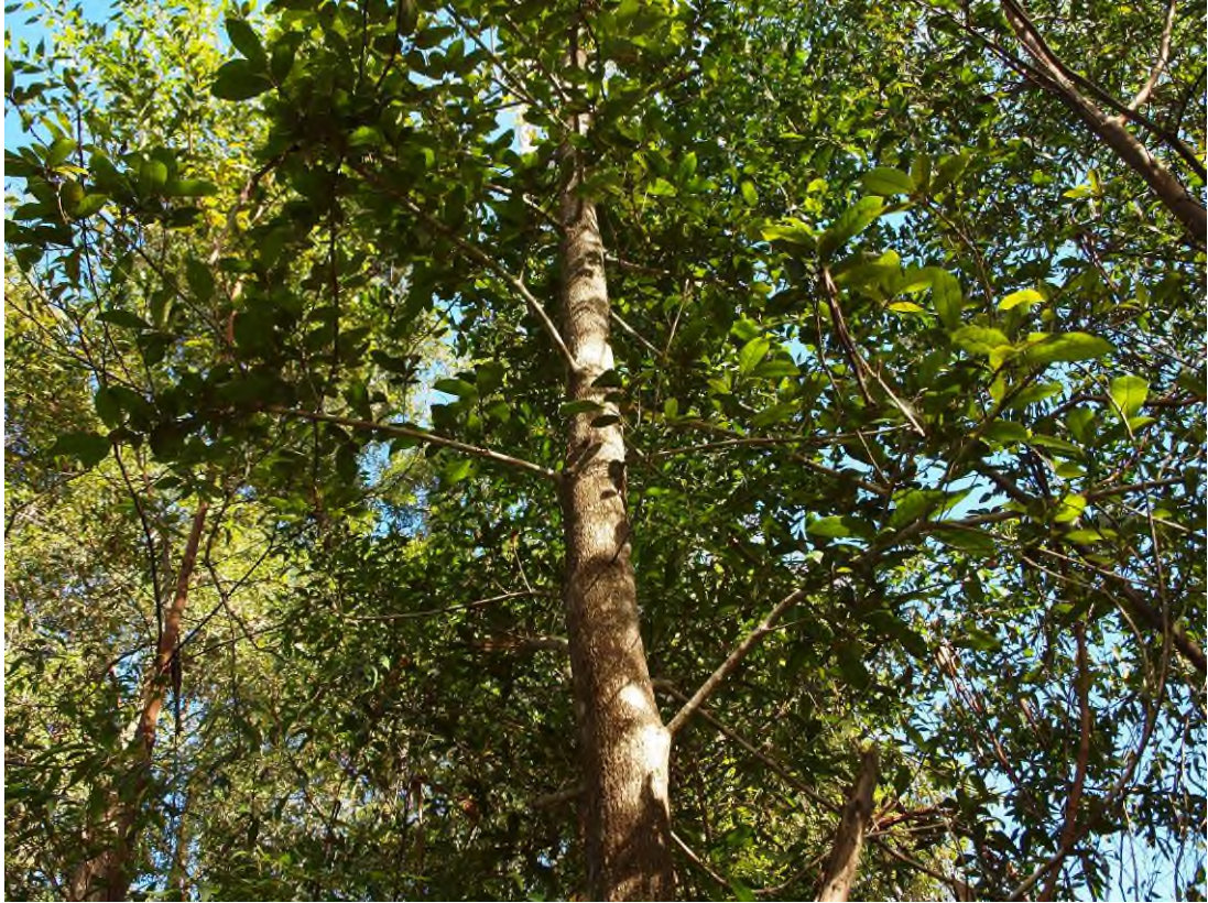
Plate 3: Rusty Plum ( Niemeyeria whitei ) is a medium sized rainforest tree.