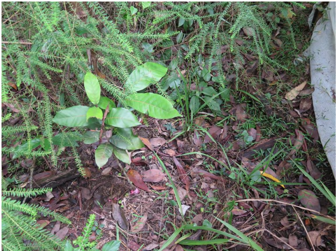
Plate 12 :Receival site no. 1, small Rusty Plum with new growth. 16/1/2017