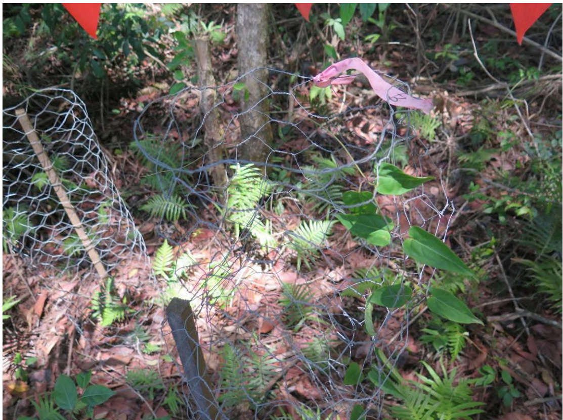
Plate 26: Receival site no. 6, plant no. 4, possible Woolls Tylophora. 17/1/2017