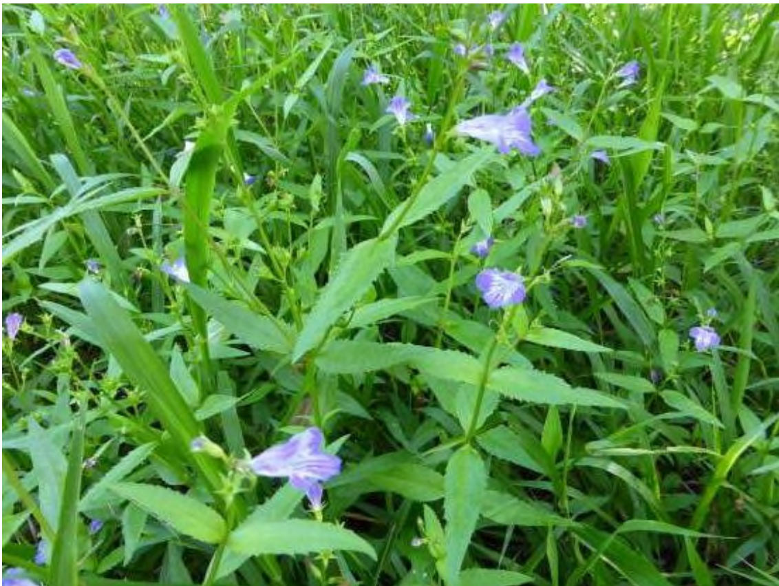
Plate 5a: Koala Bells ( Artanema fimbriatum ). An annual or short-lived perennial herb found in grassy forest on coastal floodplains.