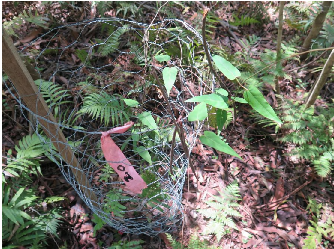
Plate 33: Receival site no. 8, plant no. 20. Slender Marsdenia