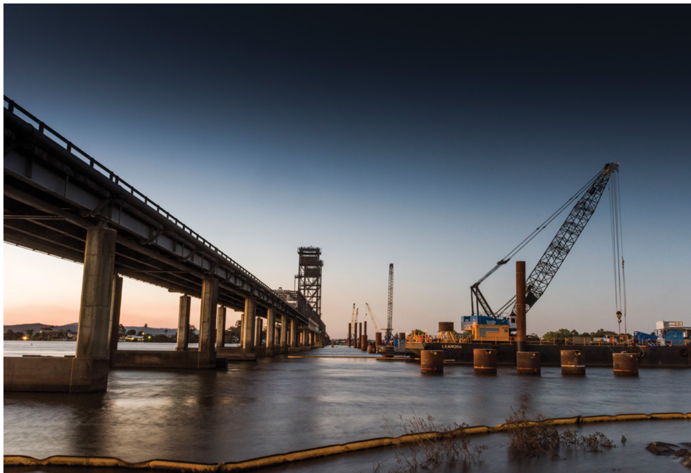
Looking north at piling for the new bridge over the Clarence River at Harwood.