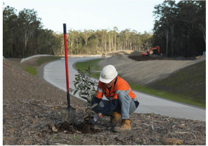
Planting native trees for revegetation