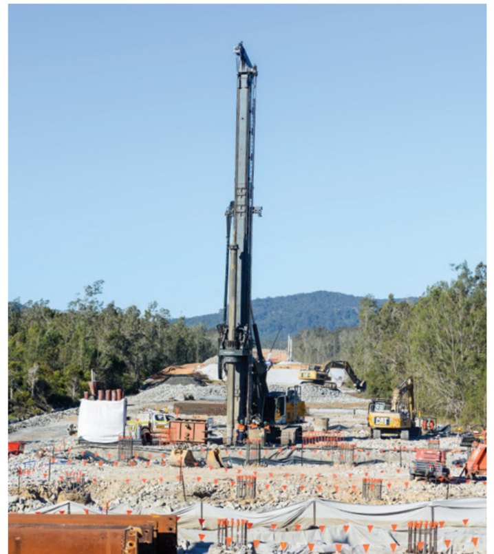
Early work for one of our bridges - bored piling rig in action at Coldstream