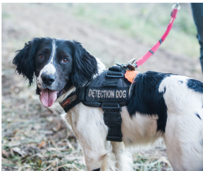
Jet, the koala detection dog who helps to find our shy koala friends, is an integral team member and feature of the Koala Management Program