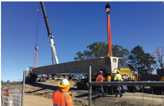
Oversize overmass truck ready for lift off

For the latest information about oversized and over mass vehicle movements for the Woolgoolga to Ballina Pacific Highway upgrade, visit our webpage rms.nsw.gov.au/w2b .