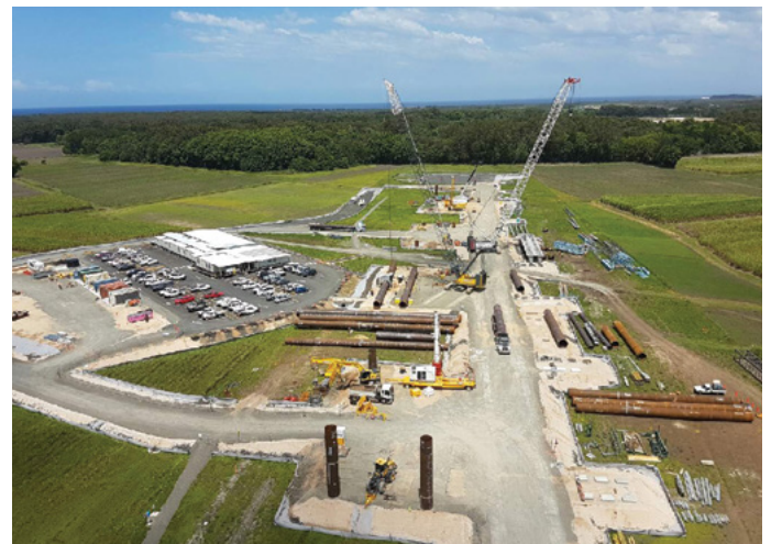
Piling work and girders on site for the new bridge over the Richmond River

This document contains important information about road projects in your area. If you require the services of an interpreter, please contact the Translating and Interpreting Service on 131 450 and ask them to call the project team on 1800 778 900. The interpreter will then assist you with translation.