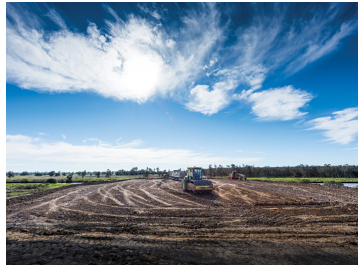
Soft soil work on the southern side of Tabbimoble Creek

We would like to thank the community for your valuable feedback during this trial.