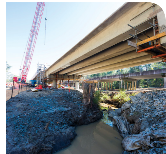
Super-T girders in place for a new bridge in Tabbimoble