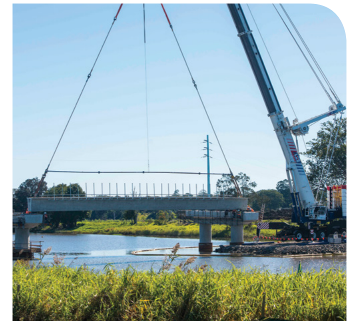
A Super-T girder being lifted into place on a similar project