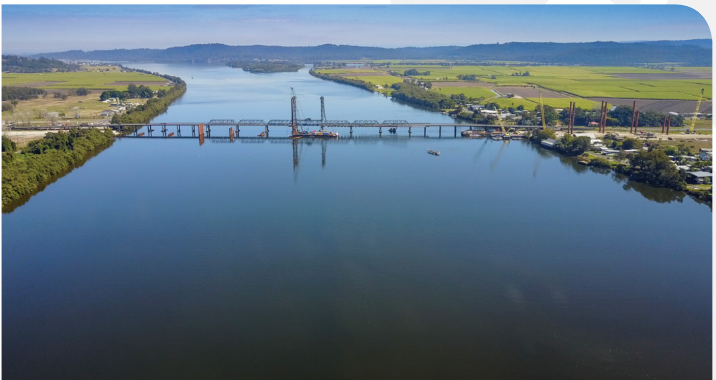
New bridge over the Clarence River at Harwood.