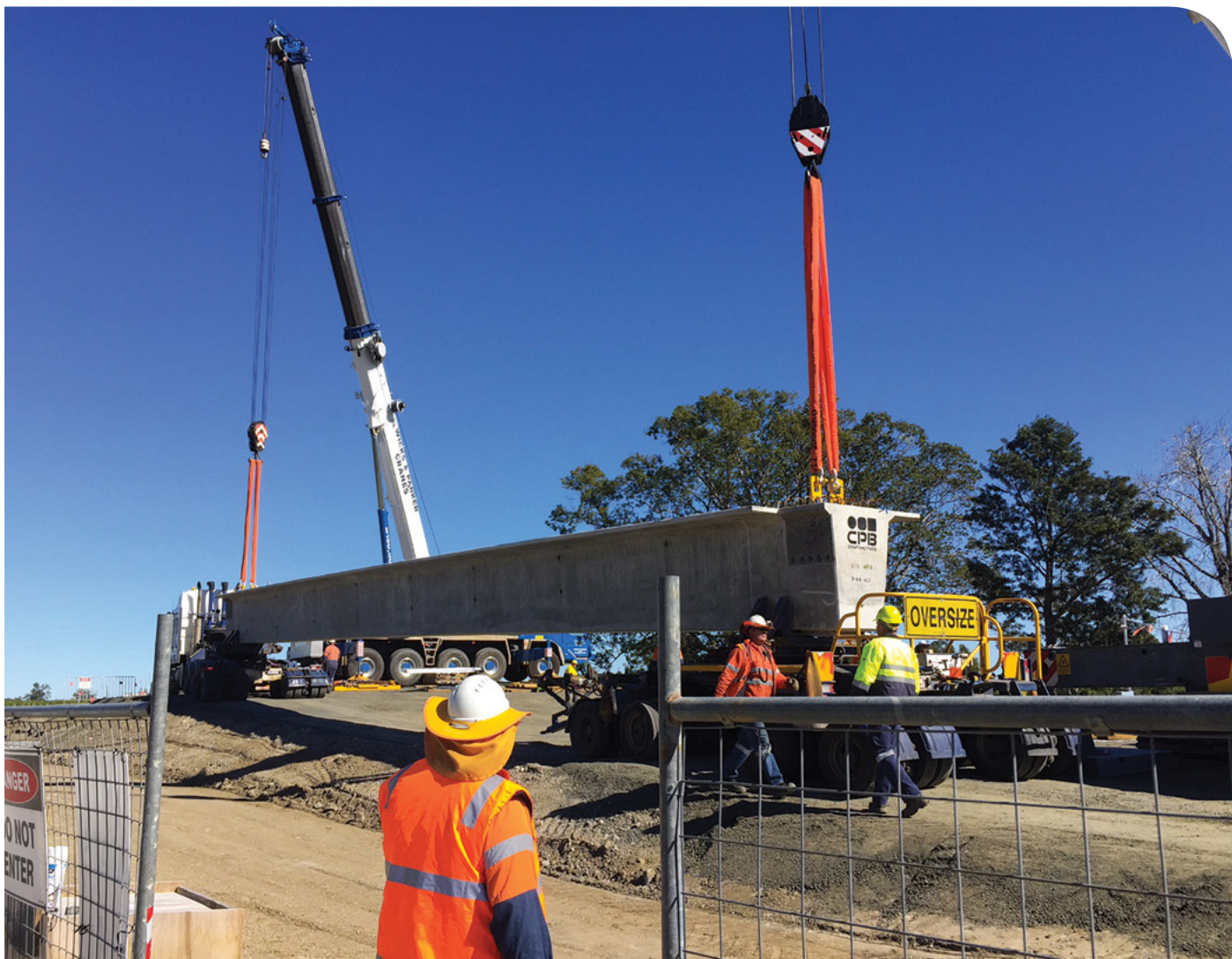
An oversize and over mass vehicle is used to transport a Super-T girder

These are in addition to the 624 planks and 145 Super-T girders already installed in the Woolgoolga to Glenugie section of the upgrade.