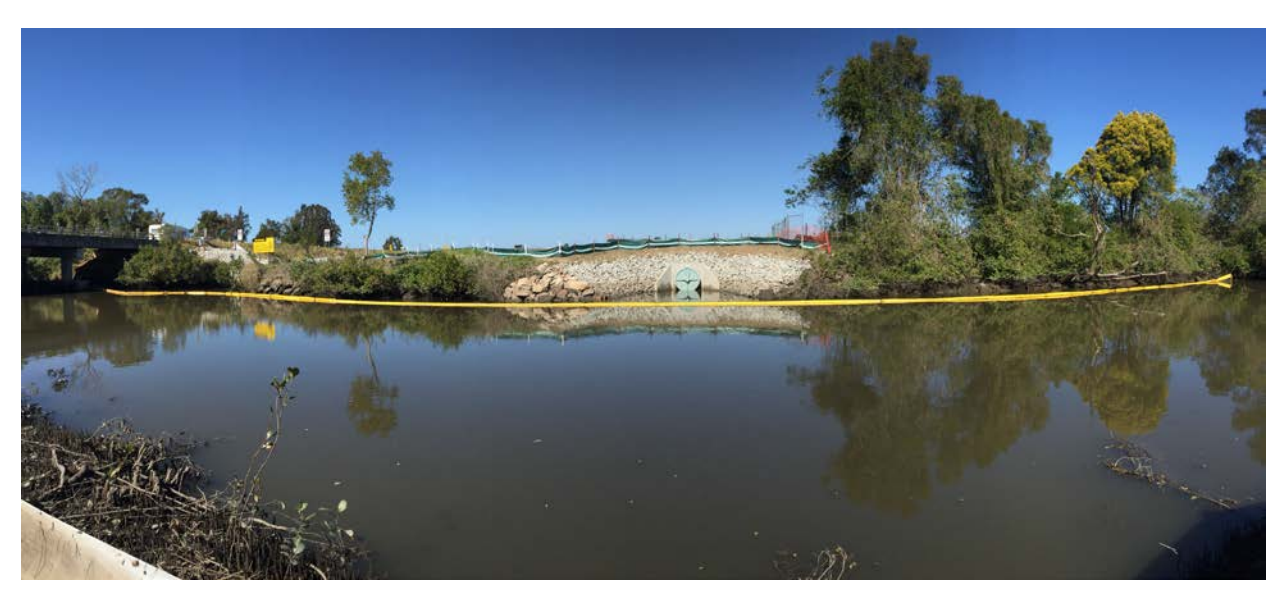
Environmental controls at Serpentine Chanel

The CEMP has strict conditions about managing the project's impact on the environment. We will try to minimise impacts to residents during this work. Access to residents' properties will be maintained and traffic control will be in place where required.