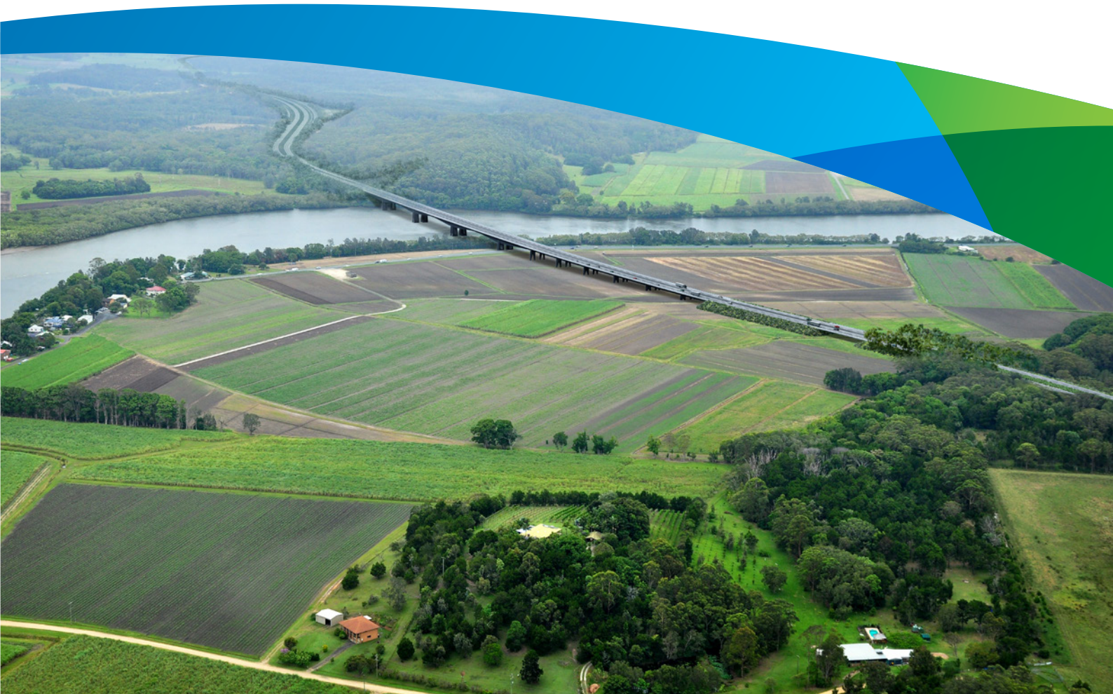
Artists impression of the new bridge over the Richmond River