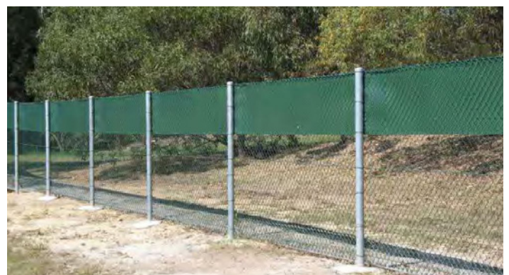
Wardell Road koala fence