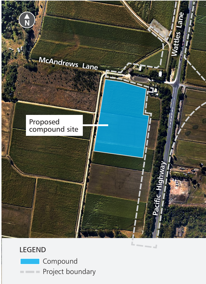
Proposed site compound at McAndrews Lane, Pimlico