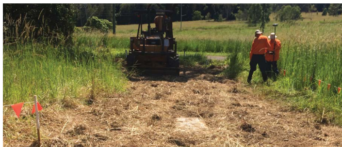
Pockets of vegetation are being cleared for utilities relocation

For activities that require access to private property, the Woolgoolga to Ballina project team will contact landowners to seek approval to enter. Thank you for your cooperation and assistance while we carry out this important work.