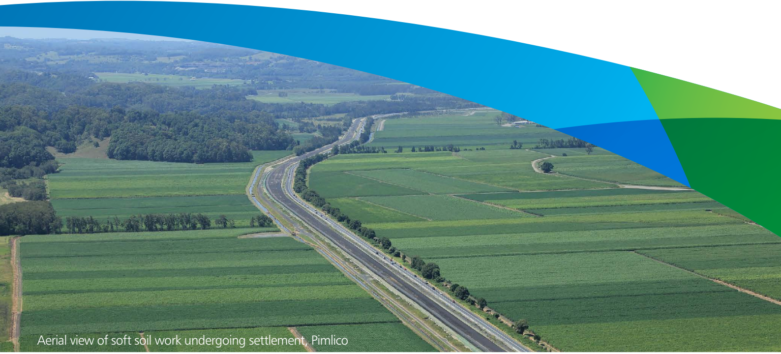
Aerial view of soft soil work undergoing settlement, Pimlico