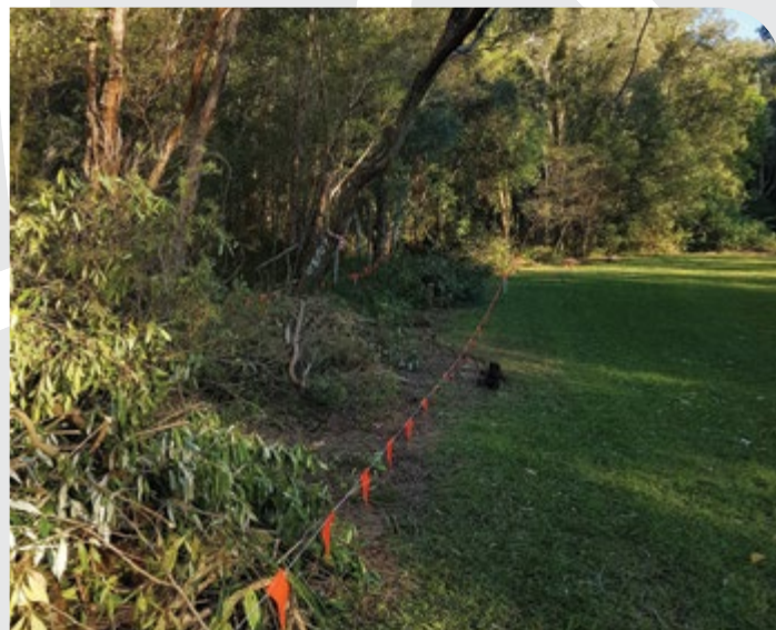
Flagging placed for vegetation clearing in preparation for utilities work

The team recognises that this type of work can represent a large, visual change to the landscape once vegetation is removed. The Community Relations team is available to take calls on any specific concerns about this work either in advance of work starting, or while the work is being carried out. You can reach the team by calling 1800 778 900 .