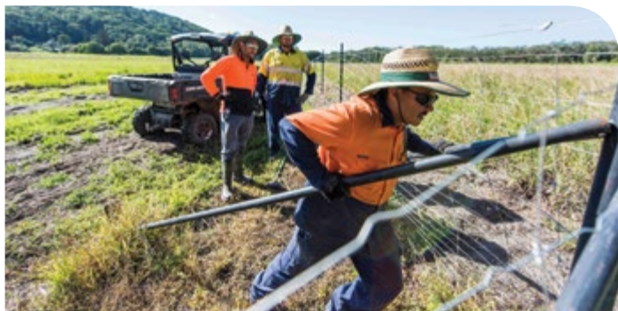
Team members from GMC Environmental Consulting installing fencing as part of the koala revegetation work

We thank them for their continued effort and valuable contribution to work in our area. If you are interested in applying for a job on the project, please go to www.pacificcomplete.com.au/jobs .