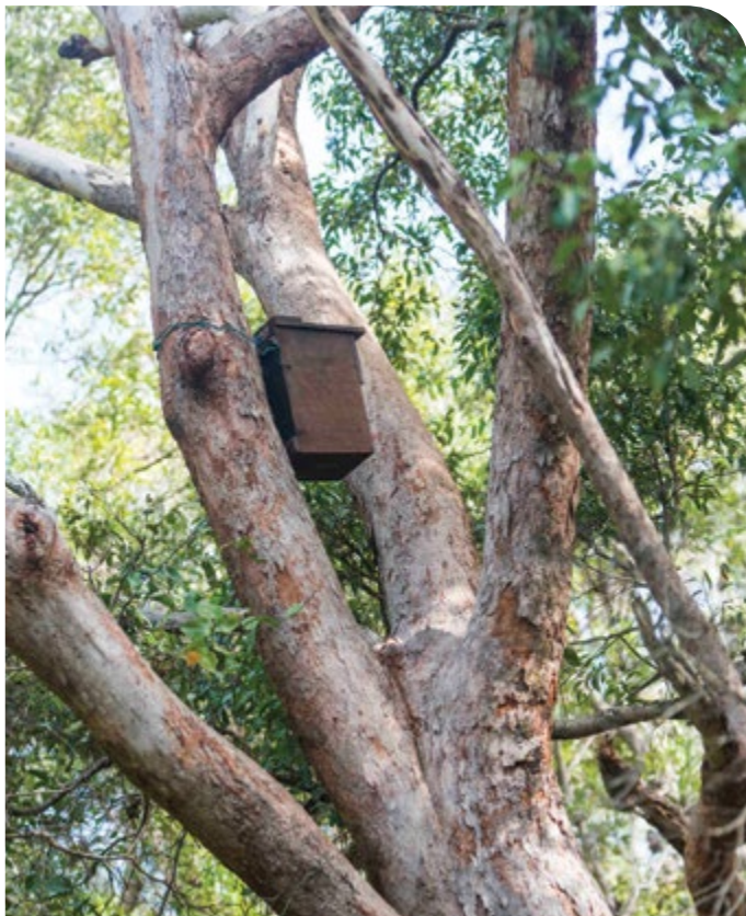
Fauna nest boxes have been installed in the area