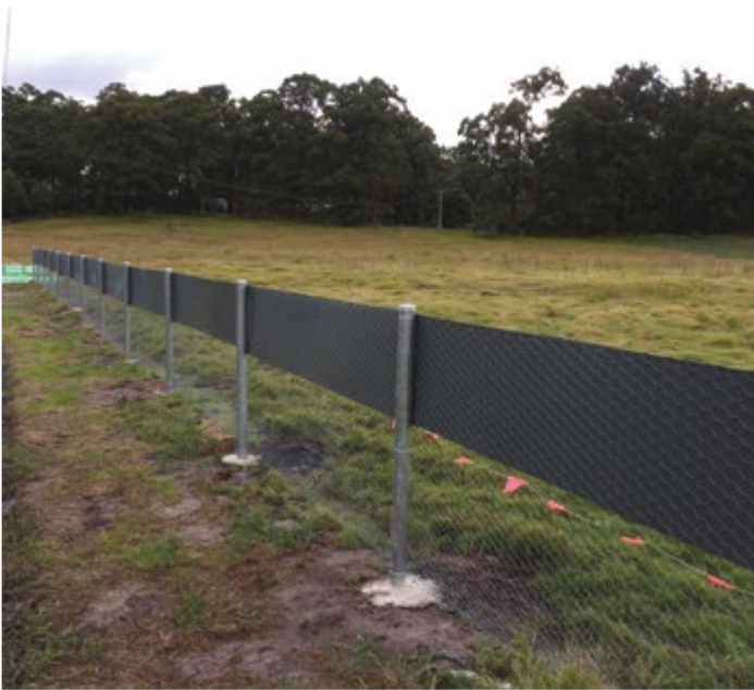
Permanent koala exclusion fencing Wardell Rd

As the project now moves into the major build phase, we will keep you informed about the next stages of delivery for the Koala Management Plan and how we intend to manage impacts on fauna.