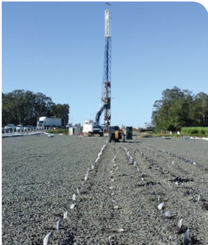
Soft soil treatment underway at Pimlico to Teven stage three

Neighbours will be contacted to provide an update of the proposed work. Road users may experience short delays during construction. We will work to minimise delays, and will provide information through Live Traffic NSW www.livetraffic.com .