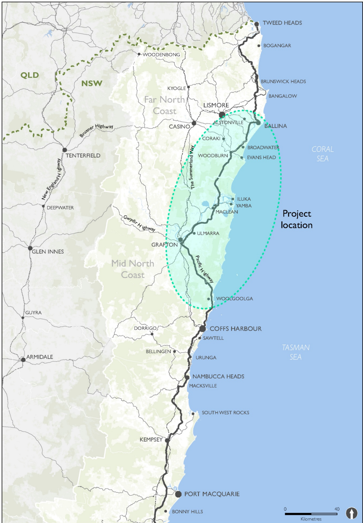
Figure 1-1: Location of the project