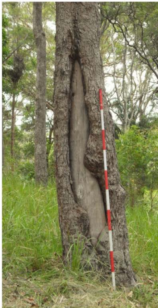
■ Figure 1 – Gumi Scarred Tree looking east

for a height of 1880 mm, with further callous tissue extending for another 640 mm from point of wound apex. It must be noted that callous tissue formation is not uniform (as seen with many other scar trees) (Figure 1).