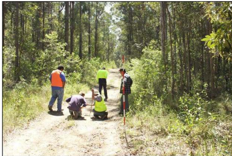
■ Figure 1: Location of Sherwood North (artefact); PAD is in rear of shot. Scale interval is 20cm.