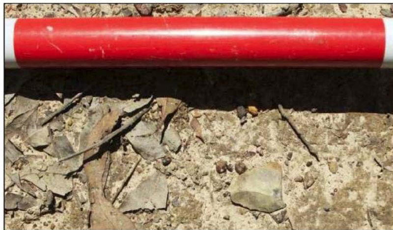
■ Figure 2: Artefact at Sherwood North; scale bar is 20 cm.

Additionally, PAD 14 and Tuckombil Canal PAD, which were previously identified from property boundaries, were decided by Aboriginal Site Officers and Archaeologists that they were no longer PADs.