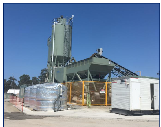
Temporary batch plant at Avenue Road, Pillar Valley for the Woolgoolga to Ballina Pacific Highway upgrade