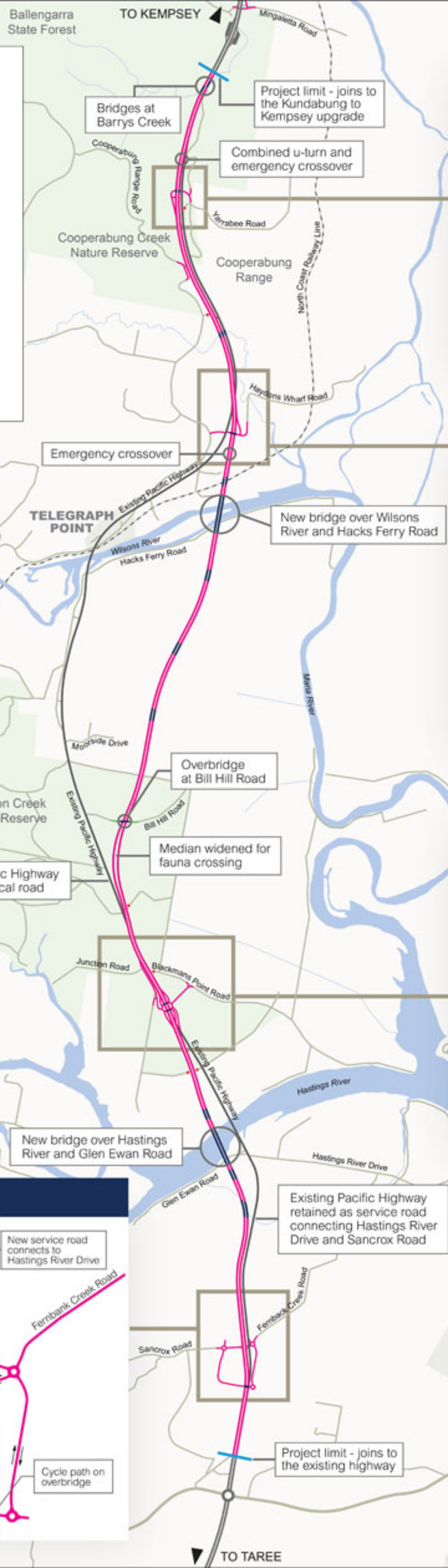
Detail of Yarrabee Road Interchange