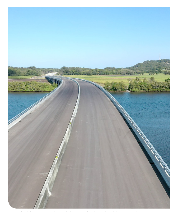
New bridge over the Richmond River looking south