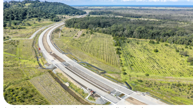
Aerial view looking north to Coolgardie interchange