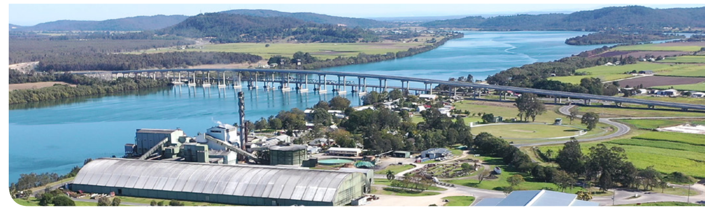
view of Harwood and the new bridge over the Clarence River