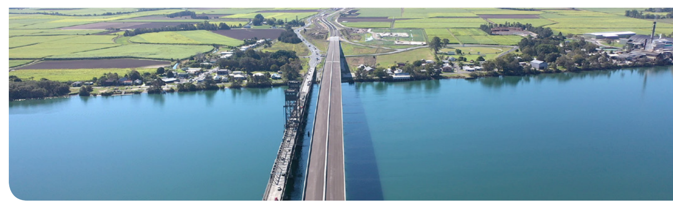
Looking north over the Harwood bridge and new bridge over the Clarence River