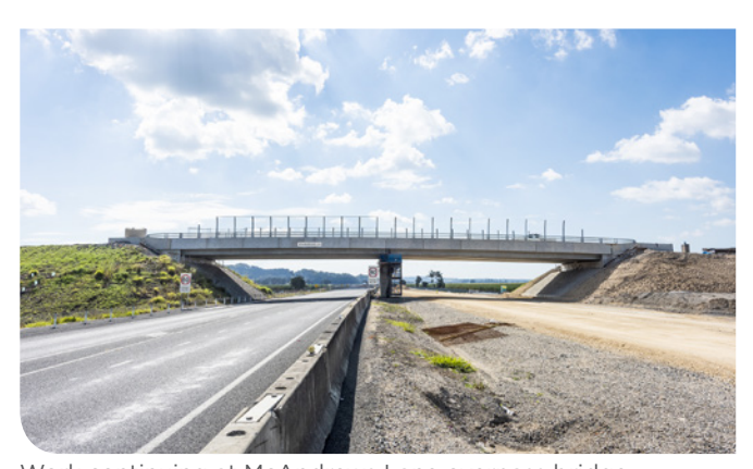
Work continuing at McAndrews Lane overpass bridge