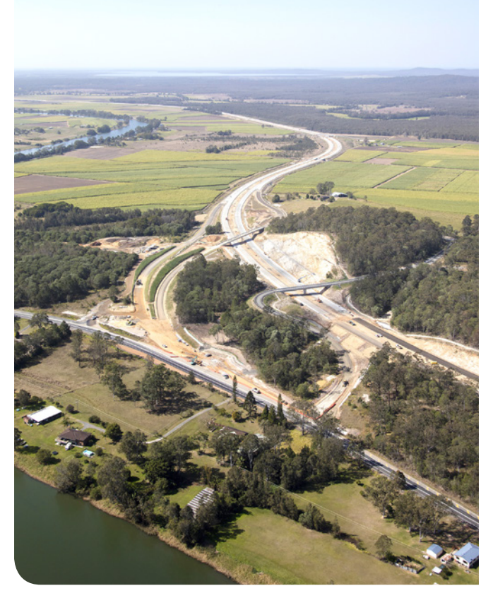
Aerial view of the Tyndale North interchange