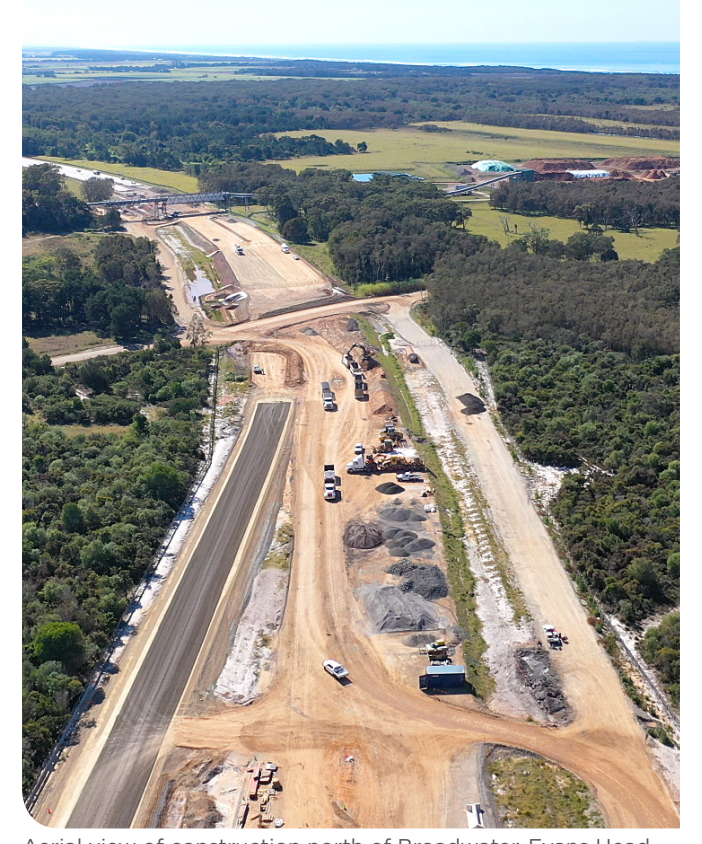
Aerial view of construction north of Broadwater-Evans Head Road \,