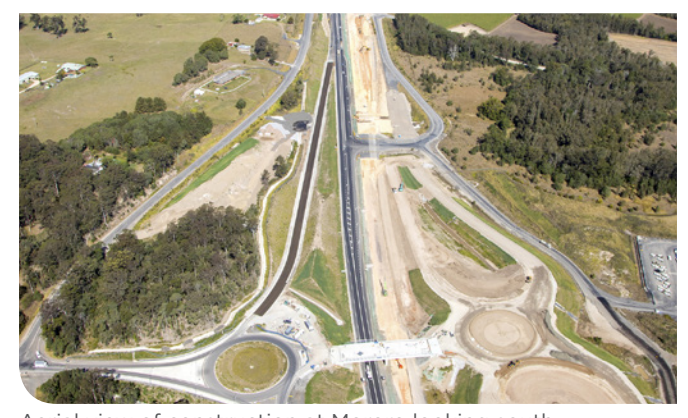
Aerial view of construction at Mororo looking south