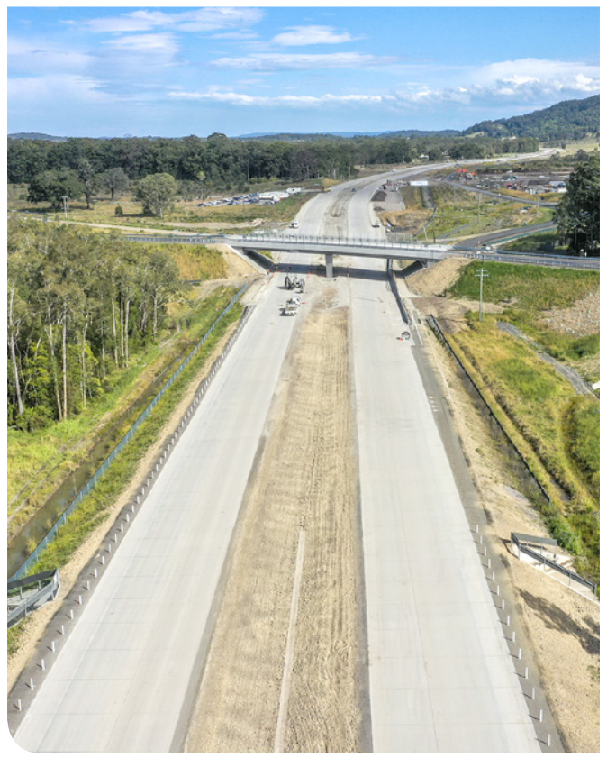
Aerial view looking south at Wardell overpass bridge