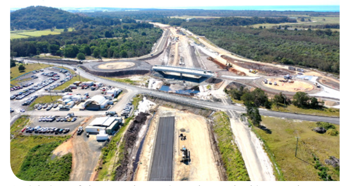
Aerial view of the Broadwater interchange looking north-east