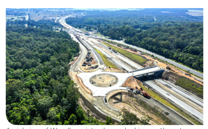
Aerial view of Woodburn interchange looking north-east