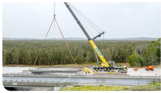
Girder lift over Koala Drive north of Maclean