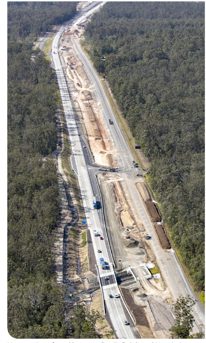
New section of road between Devils Pulpit and New Italy

For more detailed information visit the project website at www.pacifichighway.nsw.gov.au or call the Pacific Highway office on 1800 653 092