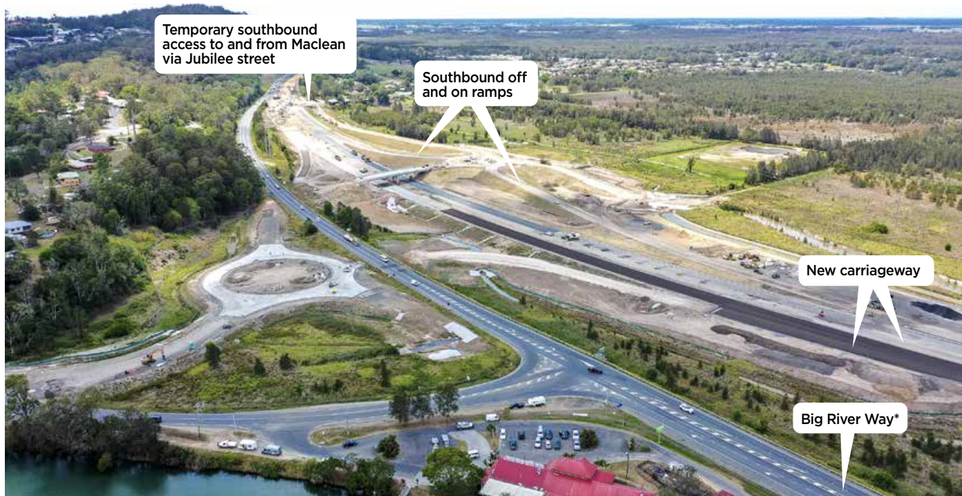
Maclean interchange looking north