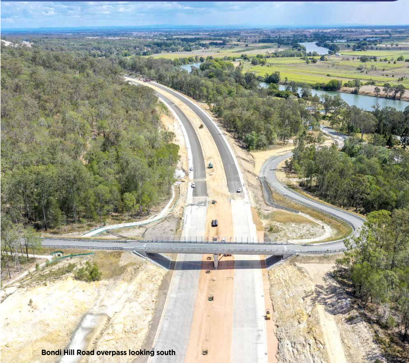
Bondi Hill Road overpass looking south