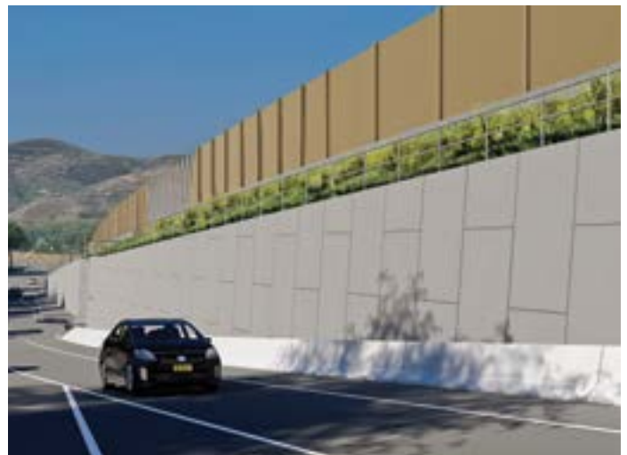
Artist impression of the retaining wall near the Old Coast Road underpass