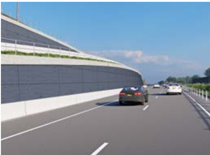
Artist impression of the retaining wall near Campbell Close