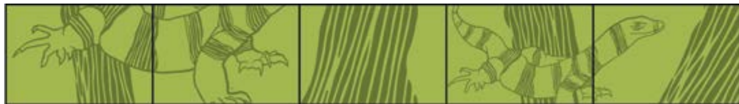
Artwork design for artwall 4 - 5x panels