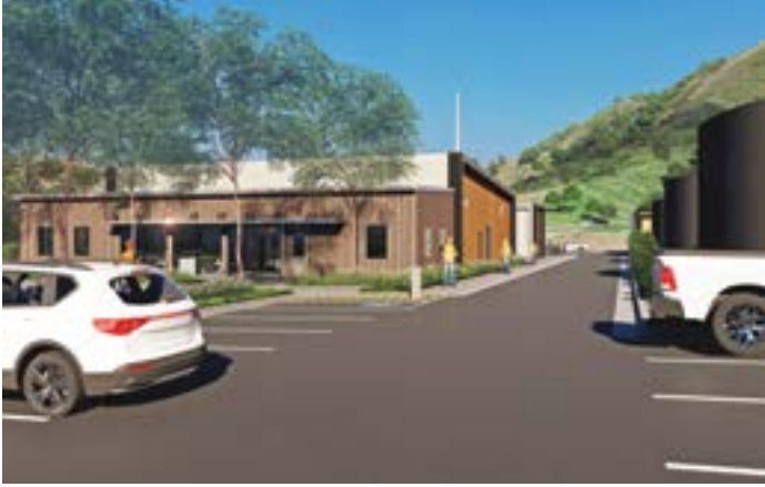
Artist impressions of Roberts Hill Tunnel equipment room