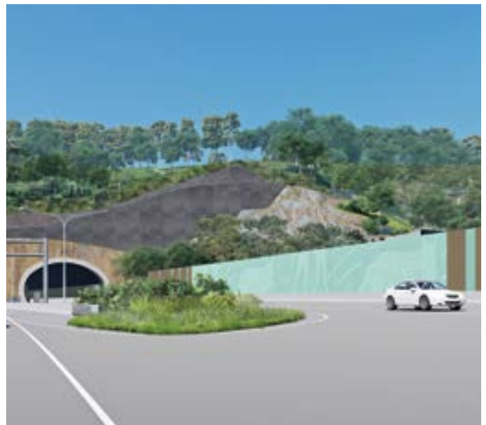
Artist impression of artwall 2 south of Roberts Hill Tunnel