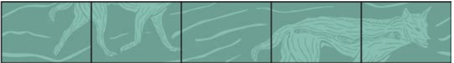
Artwork design for artwall 2 - 5x panels