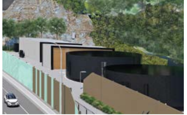
Roberts Hill Tunnel equipment room