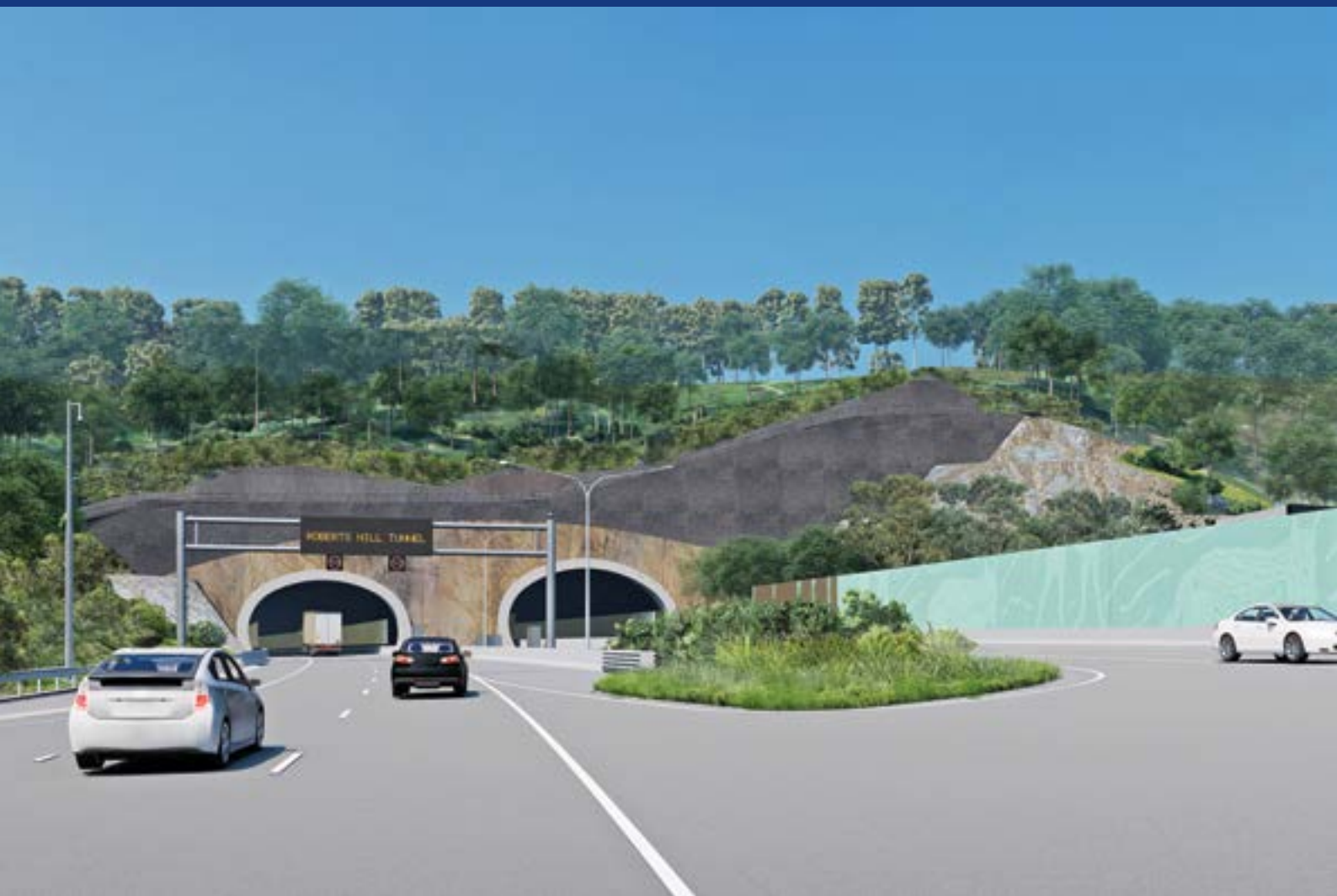
Artist impression of the Roberts Hill Tunnel and artwall south of the portal