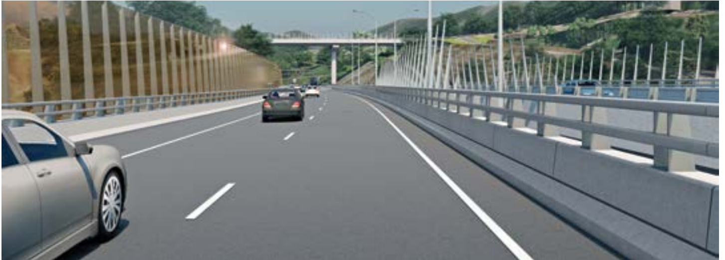
Bridge over highway on Shephards Lane from the southbound lanes