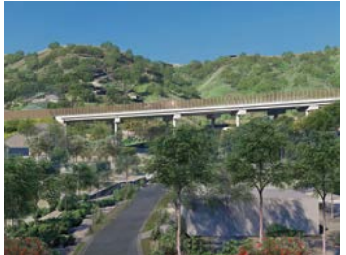
Artist impression of bridge over North Coast railway, from residential area