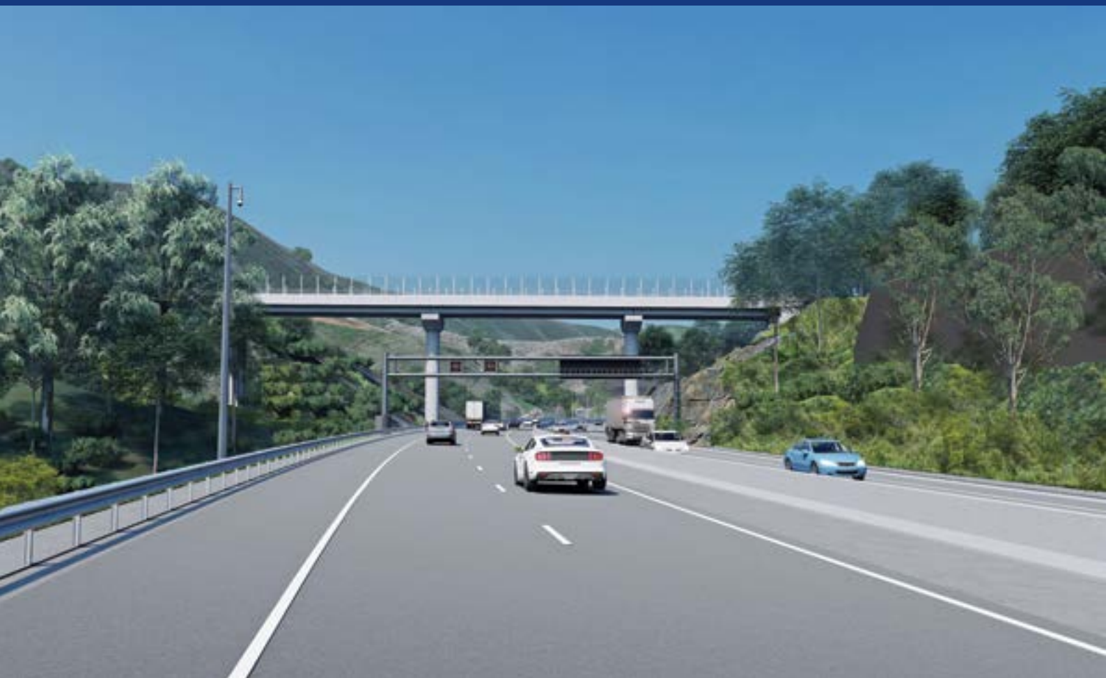
Bridge over highway on Shephards Lane from the northbound lanes