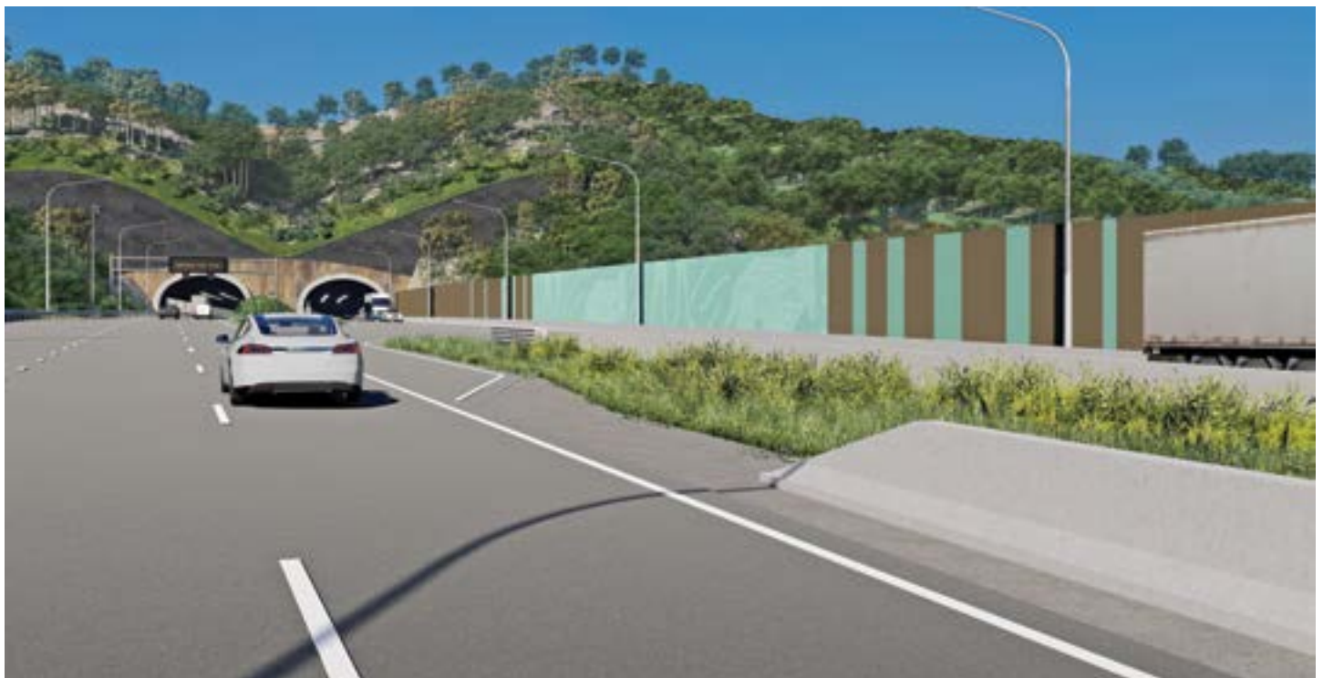
Artist impressions of the Shephards Lane Tunnel