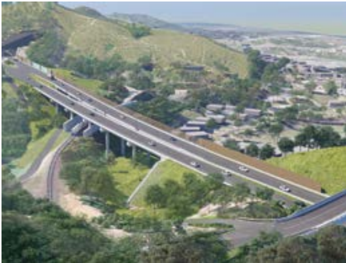
Artist impression of bridge over North Coast railway, from above