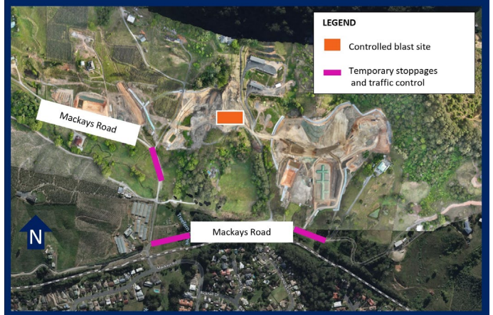
Controlled blast site and traffic control locations

Controlled blasting for this cut will be carried out during approved construction hours, specifically between 9am and 5pm Monday to Friday and 9am to 1pm on Saturdays . For more information, please read our controlled blasting factsheet at pacifichighway.nsw.gov.au/coffsharbourbypass .