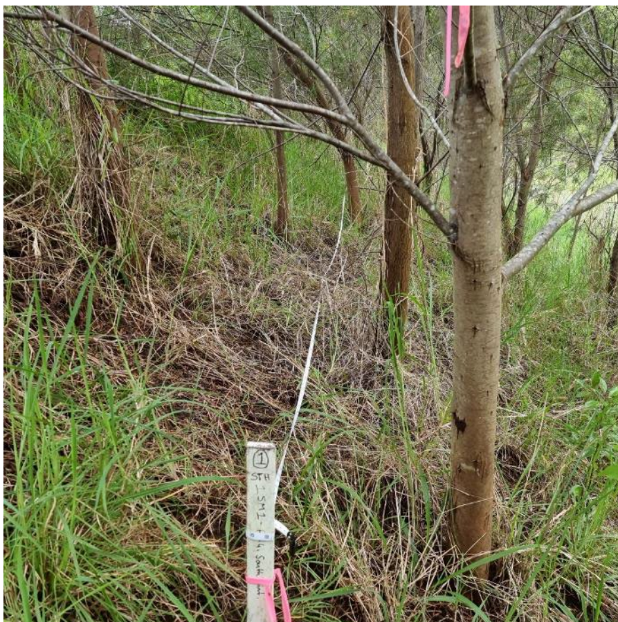
Site 1: southern end, Spring 2021.