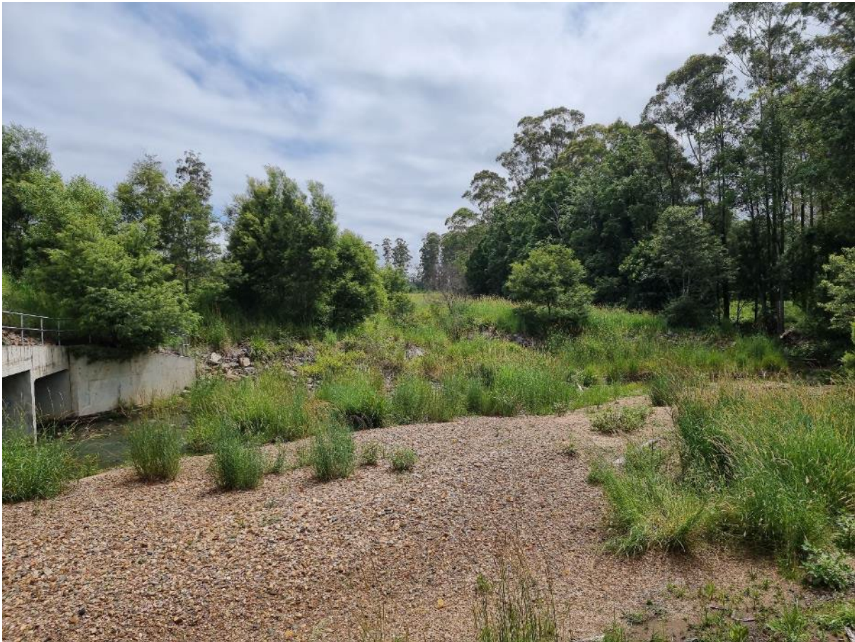
Site 12, southern end, Spring 2021.