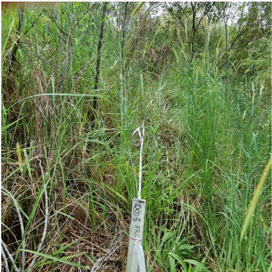
Site 8, southern end, Spring 2021.