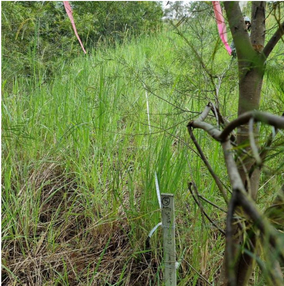
Site 5: northern end, Spring 2021.