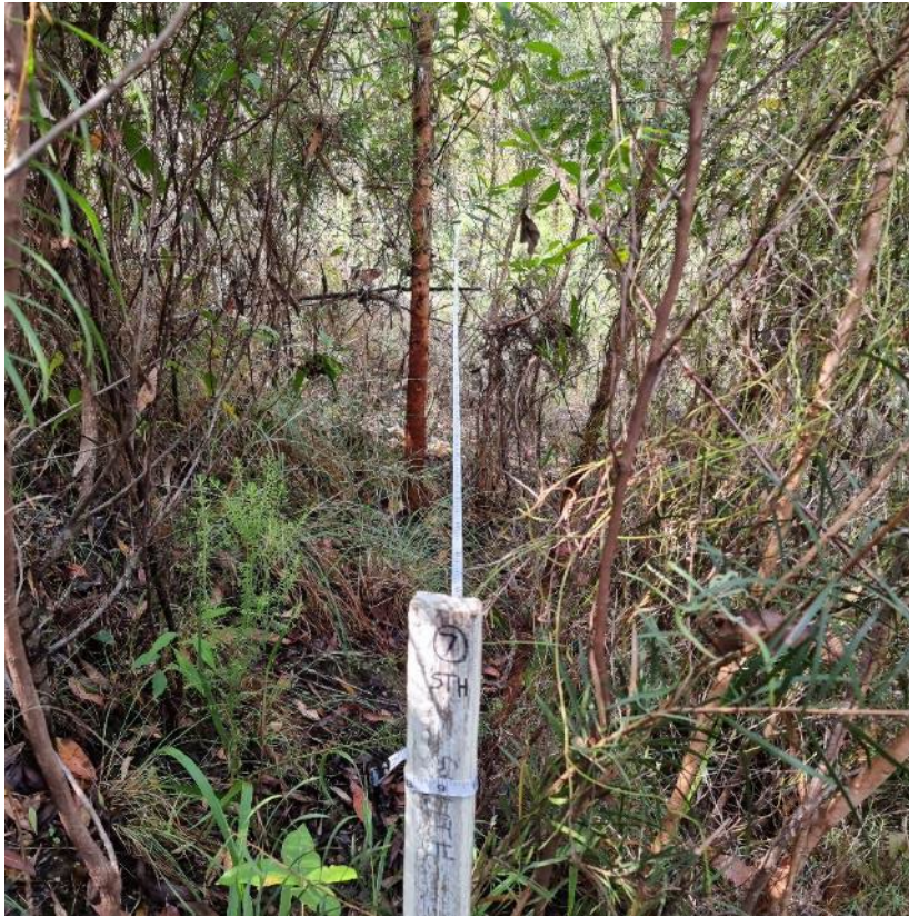
Site 7 , southern end, Spring 2021.