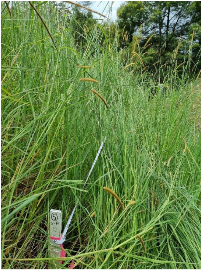
Site 5: southern end, Spring 2021.