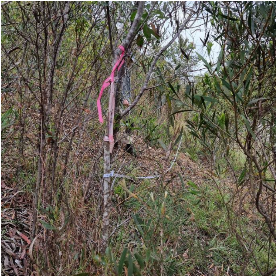
Site 6, northern end, Spring 2021.