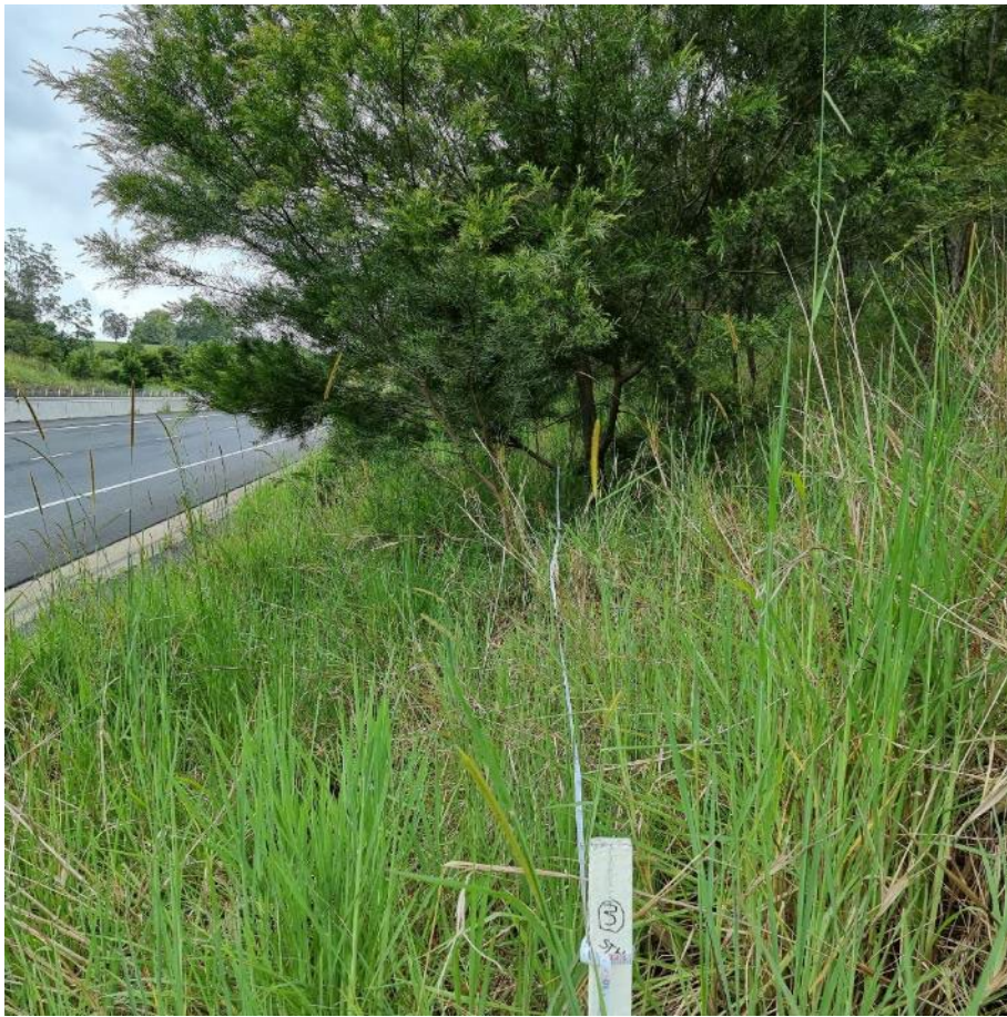
Site 3: southern end, Spring 2021.