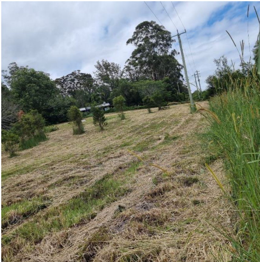
Site 4: northern end, Spring 2021.