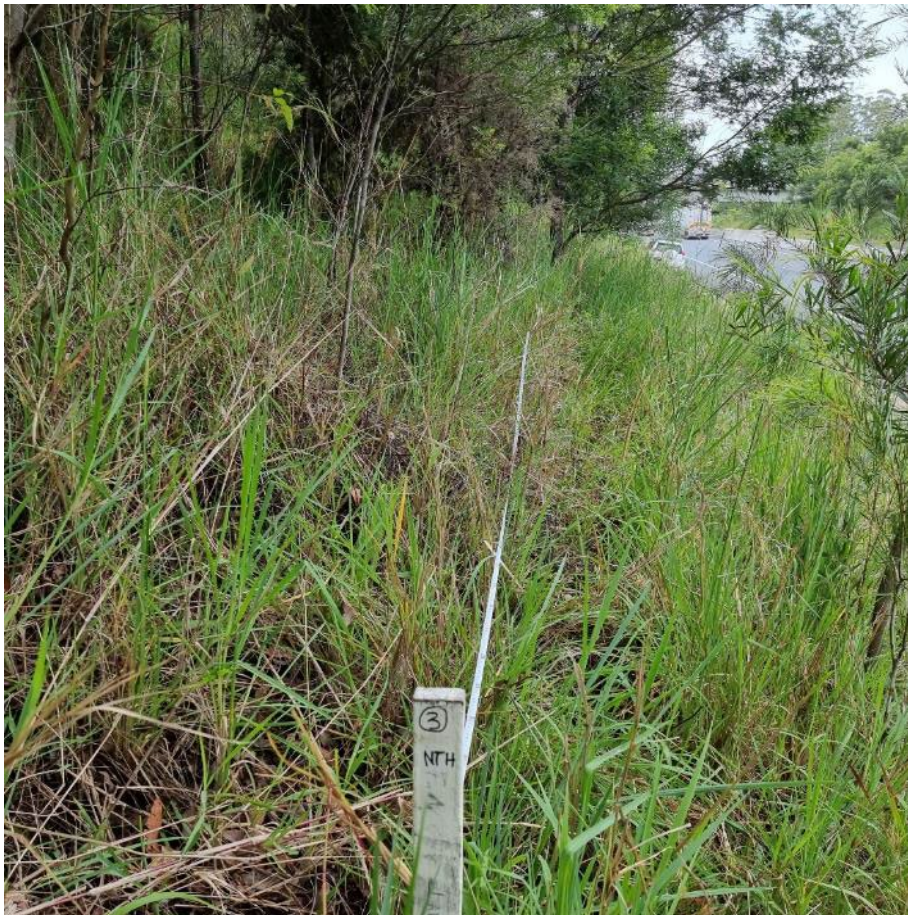
Site 3: northern end, Spring 2021.