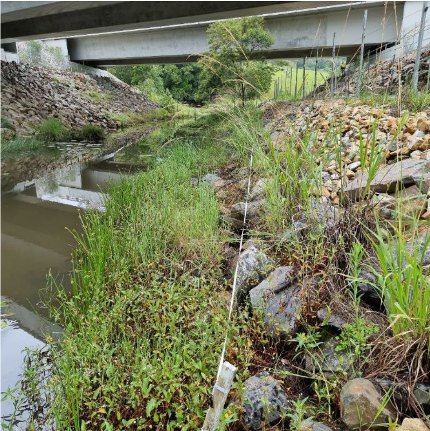
Site 10, western end, Spring 2021.