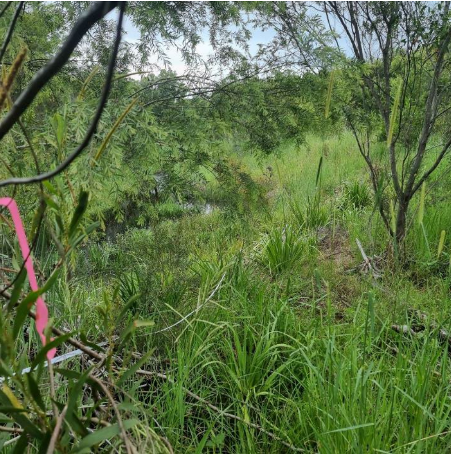
Site 11, northern end, Spring 2021.