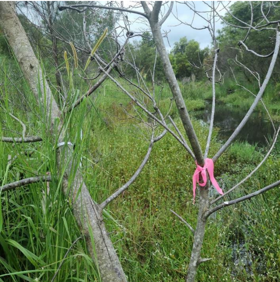
Site 11, southern end, Spring 2021.