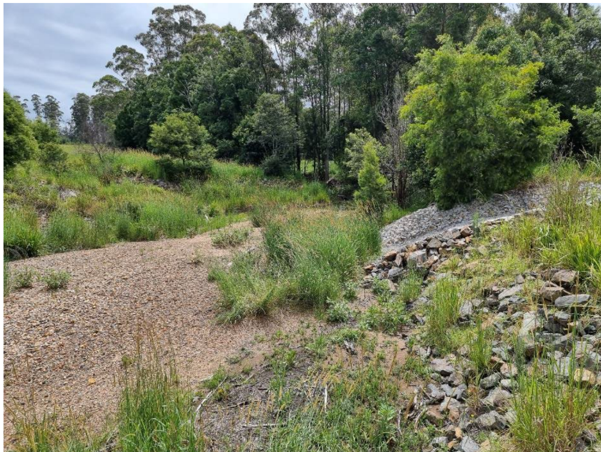
Site 12, northern end, Spring 2021.