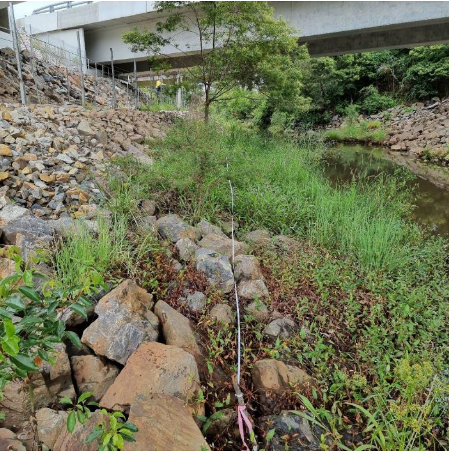
Site 10, eastern end, Spring 2021.