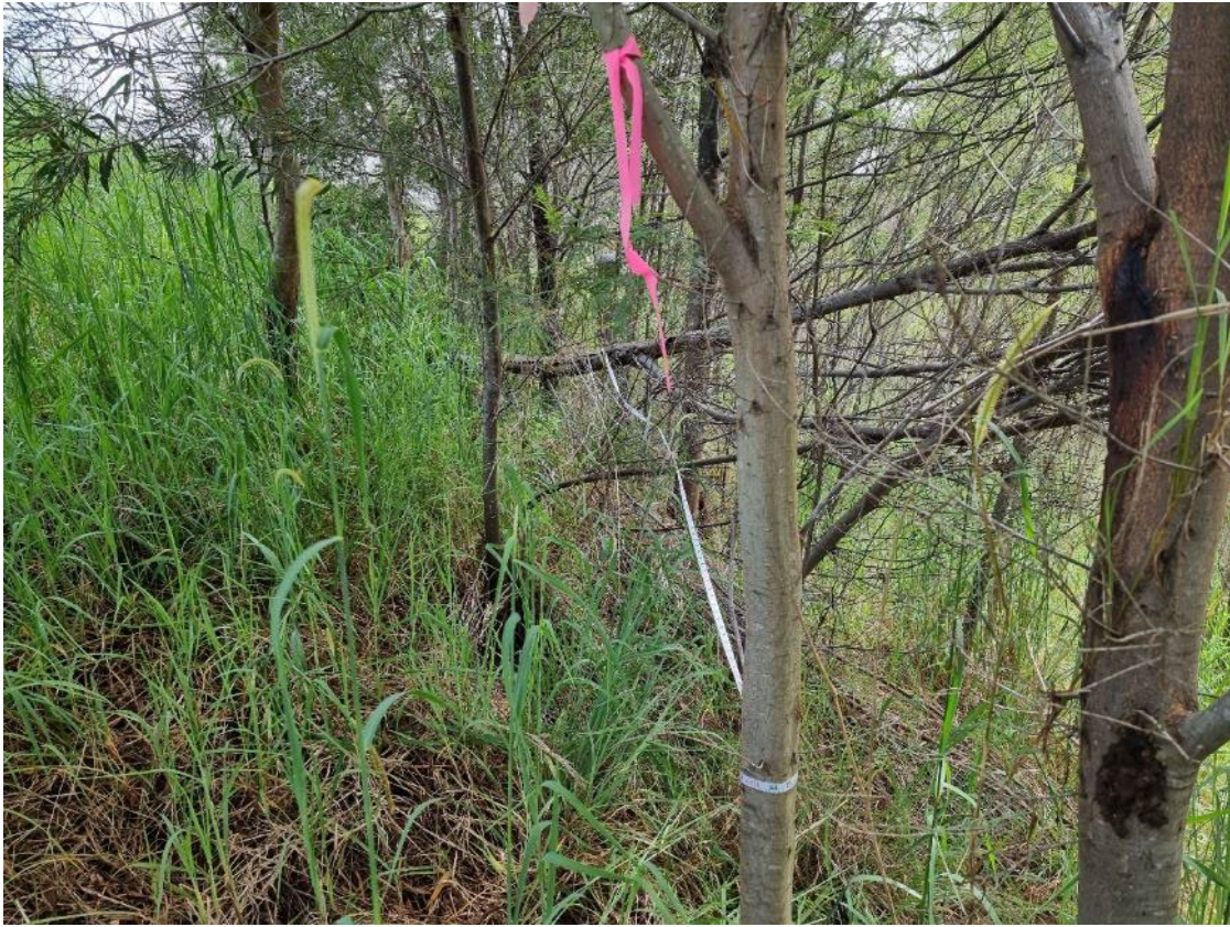
Site 2: southern end, Spring 2021.