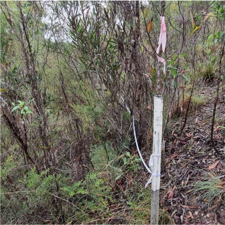
Site 6, southern end, Spring 2021.