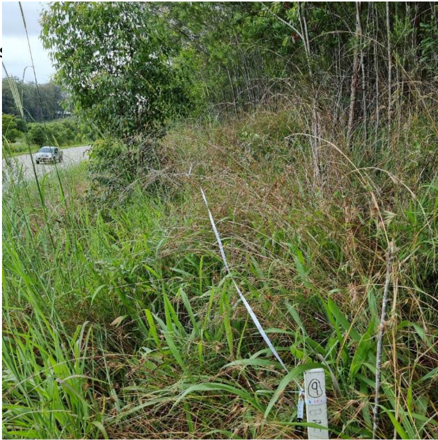
Site 9, southern end, Spring 2021.