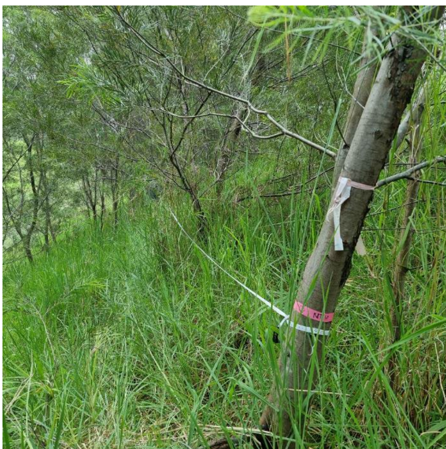
Site 1: northern end, Spring 2021.