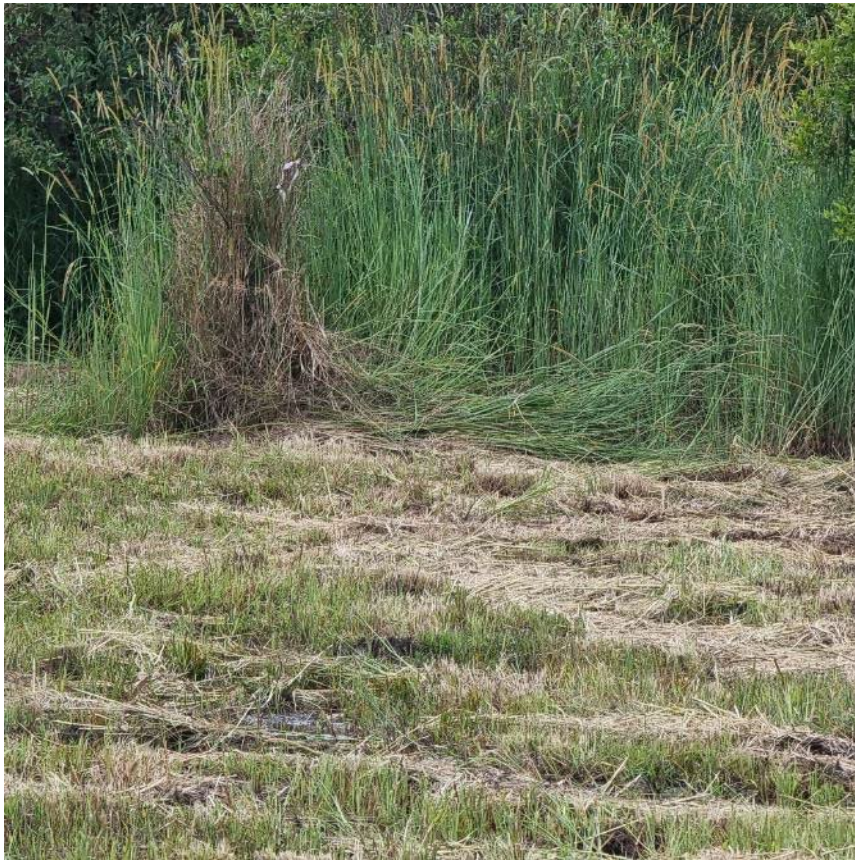
Site 4: southern end, Spring 2021.