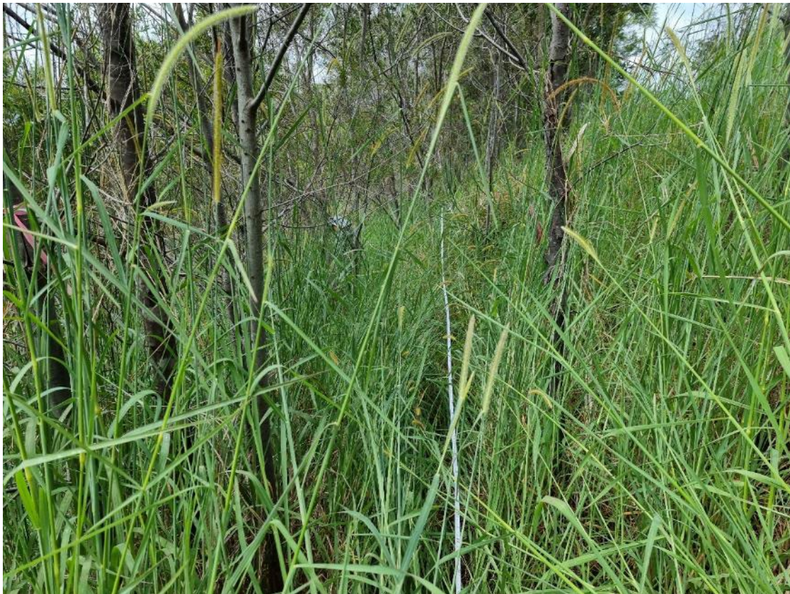
Site 2: northern end, Spring 2021.